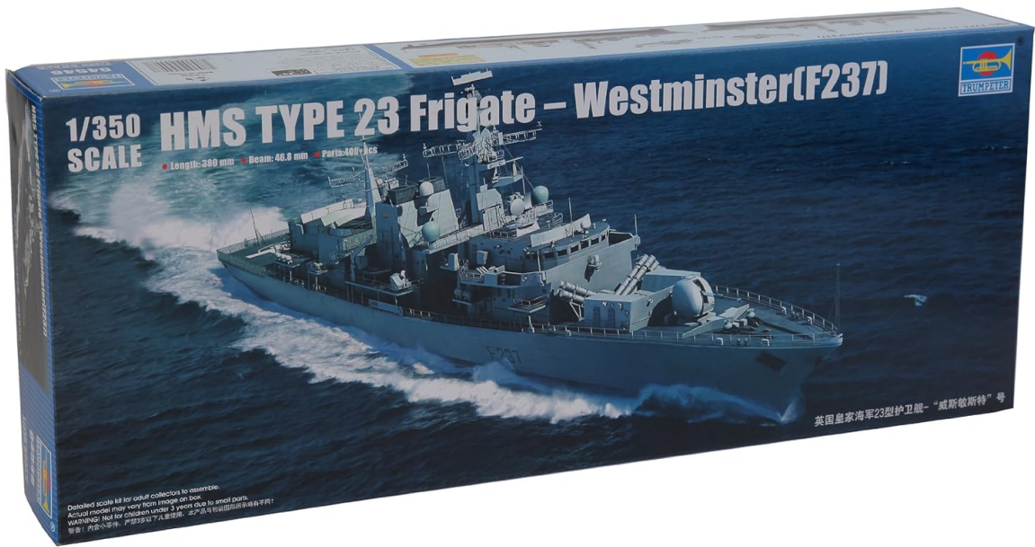
Image 1: The packaging for the Trumpeter HMS Type 23 Frigate Westminister F237 model kit, displaying the finished model on the box art.