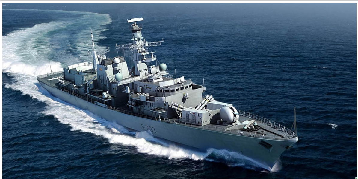
Image 2: A detailed view of the completed HMS Type 23 Frigate Westminister F237 model, showcasing its intricate design and scale accuracy.