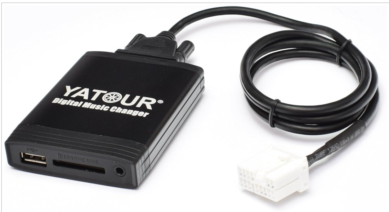
Figure 1: Yatour YT-M06 Digital Music Changer unit with connection cable. The unit is black with 'YATOUR Digital Music Changer' branding. It features USB, SD/SDHC/MMC card slots, and an AUX input.