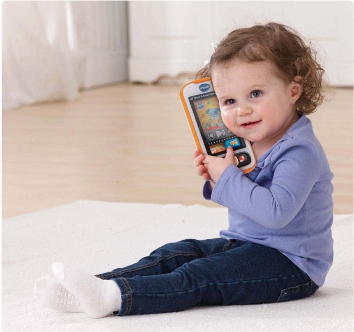
Image: A baby holding the orange VTech Touch and Swipe Baby Phone to their ear, simulating a phone call.