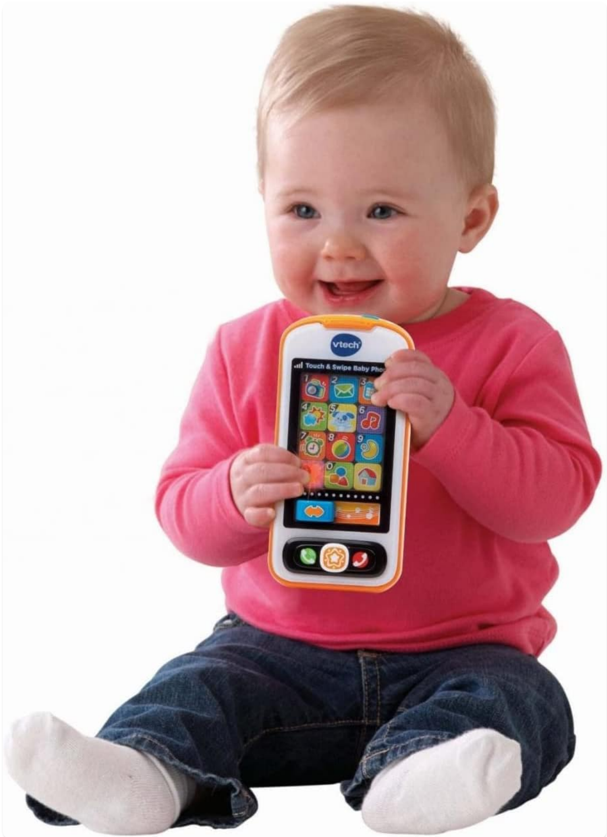
Image: A baby holding the orange VTech Touch and Swipe Baby Phone, with the screen displaying various colorful app icons.