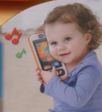
Image: The VTech Touch and Swipe Baby Phone displayed in its colorful retail packaging.