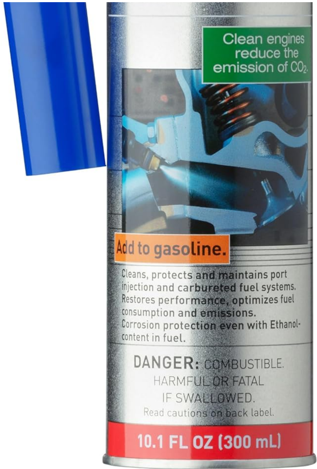
Image: Front view of the Liqui Moly Jectron Gasoline Fuel Injection Cleaner bottle, highlighting the brand, product name, and primary benefits.