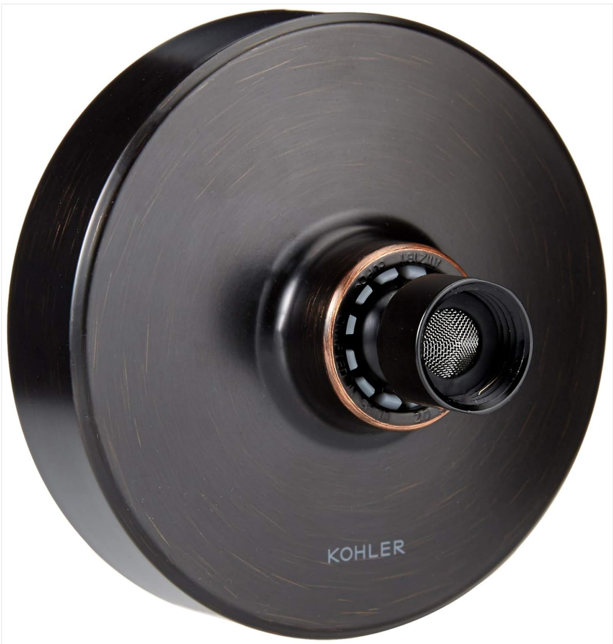
Image: Rear view of the Awaken showerhead, illustrating the standard threaded connection point for installation onto a shower arm.