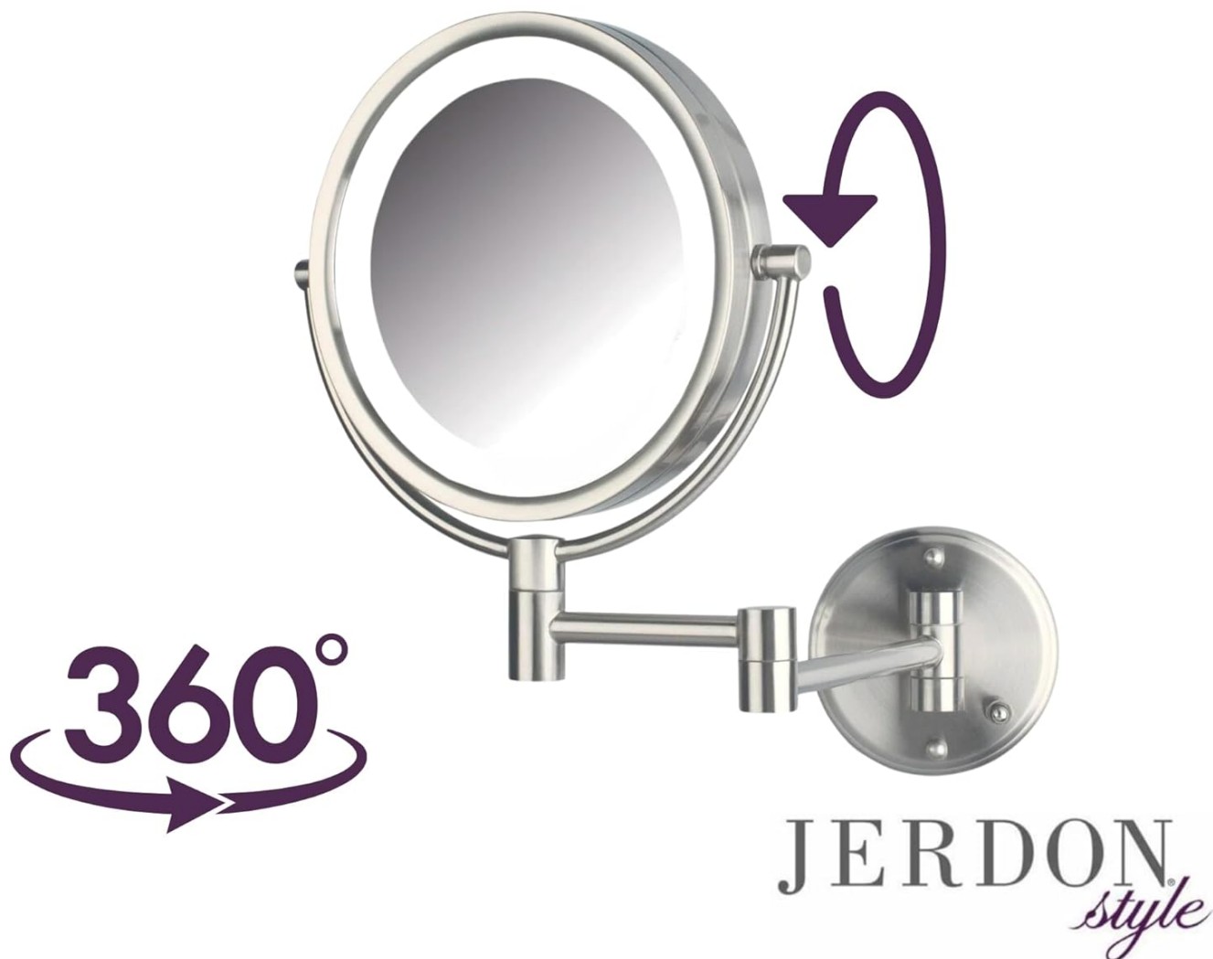
Image: The mirror's 360-degree swivel feature, allowing users to easily switch between the regular and magnified sides.