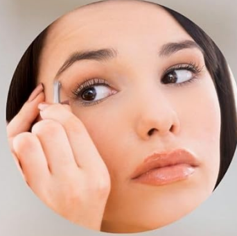
Tweezing & Shaving