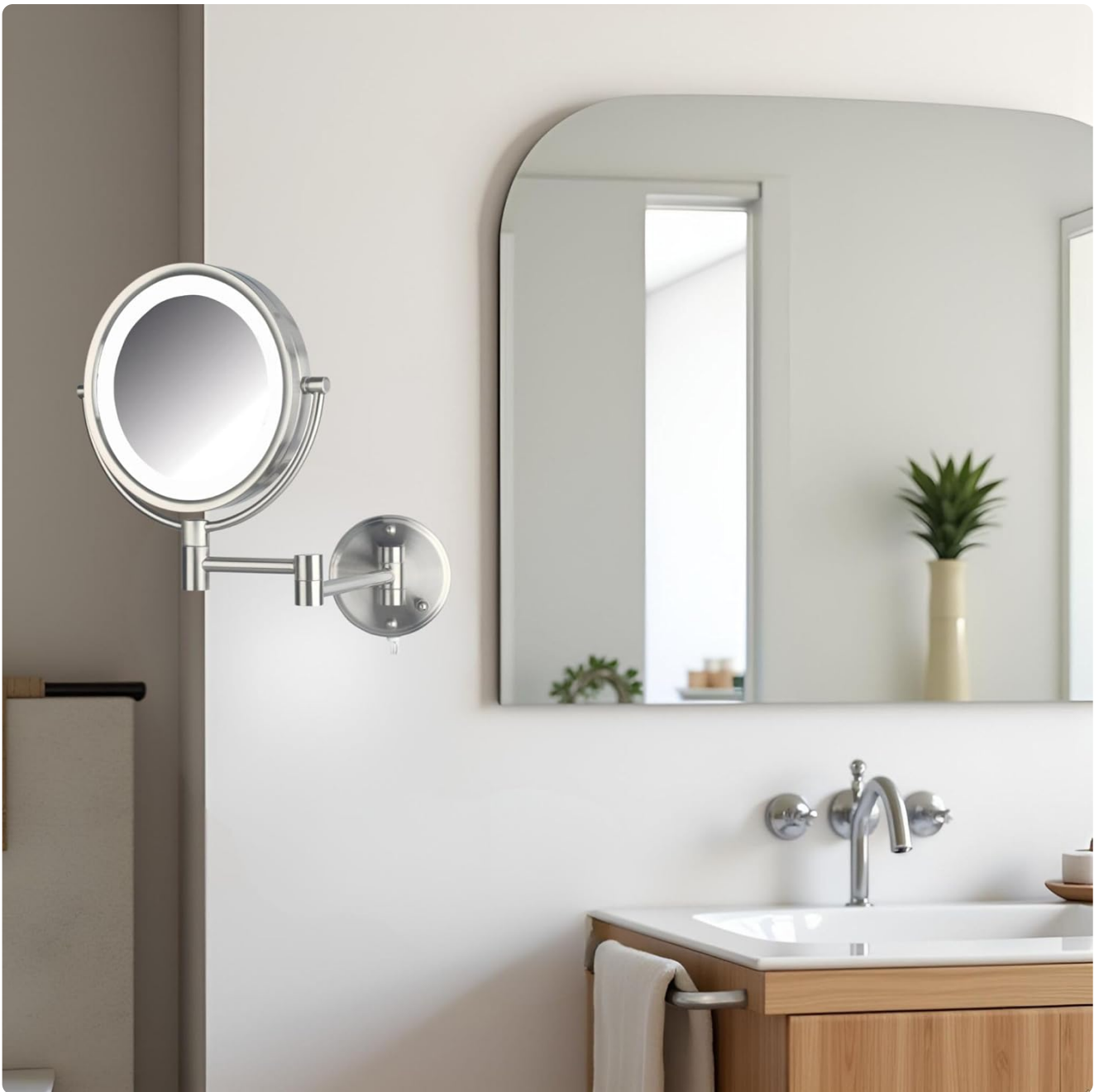
Image: Jerdon Wall-Mounted Vanity Mirror installed in a modern bathroom setting, showcasing its extendable arm and integrated lighting.