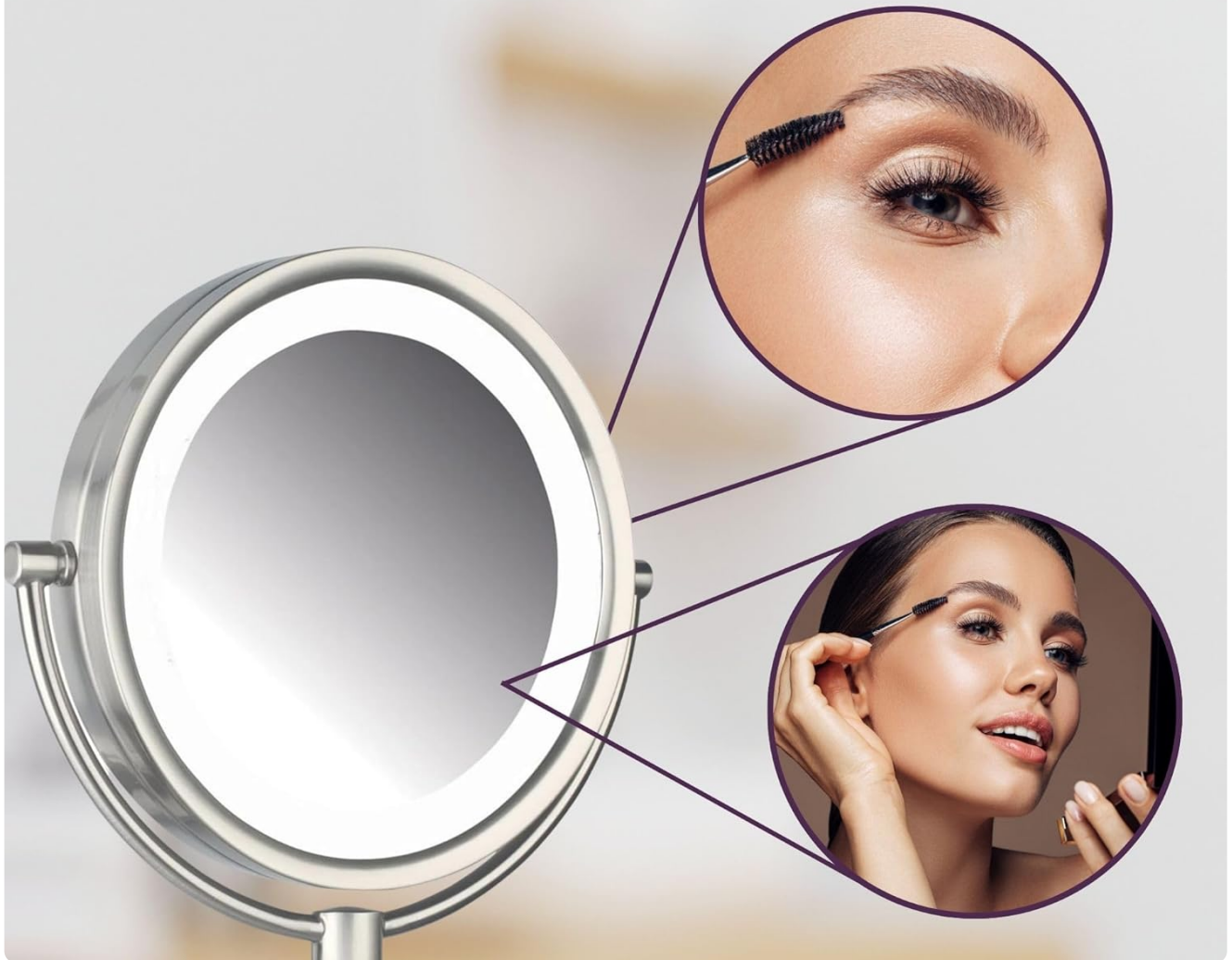
Image: A visual demonstrating the dual 8X and 1X magnification capabilities, ideal for detailed tasks like makeup application and tweezing.