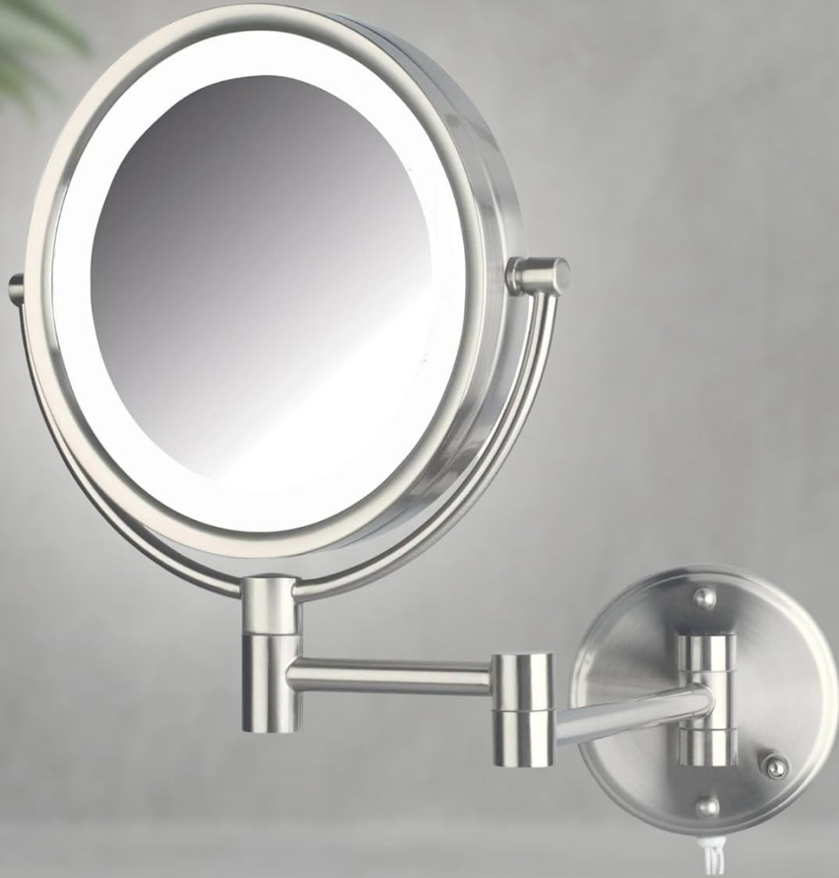
Image: The plug-in model of the mirror, highlighting its 6.5-foot coiled power cord for easy connection to an outlet.