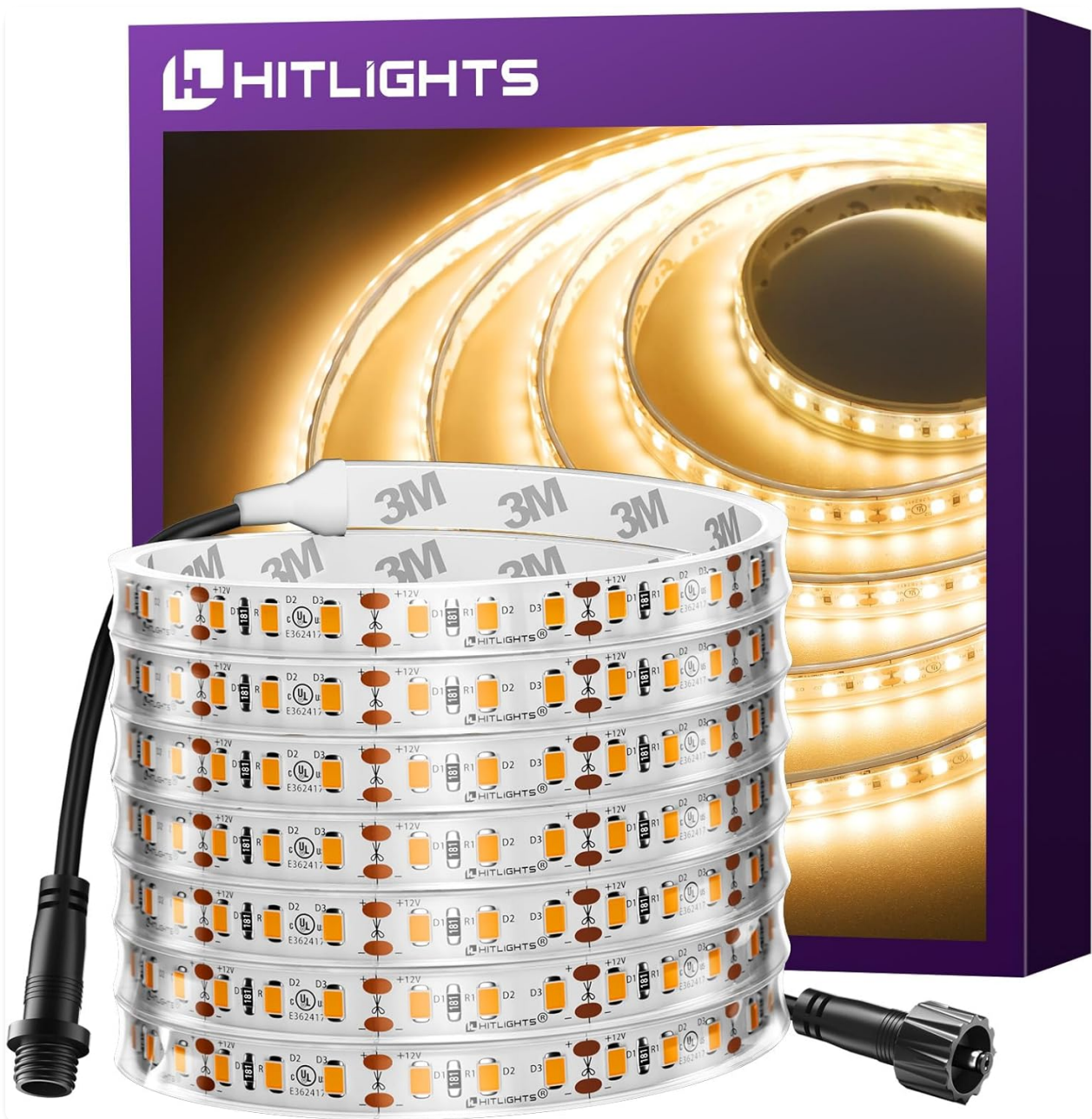
Main product image showing the LED strip lights coiled in their packaging.