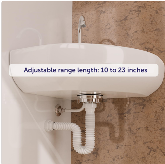
Image: The P-Trap installed under a bathroom sink, demonstrating its adjustable length and flexibility.