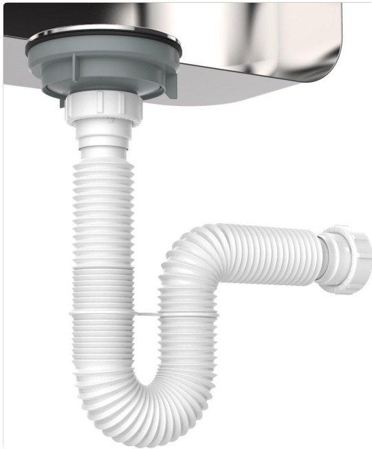
Image: Example of the Flexible P-Trap installed under a sink, forming the required water seal.