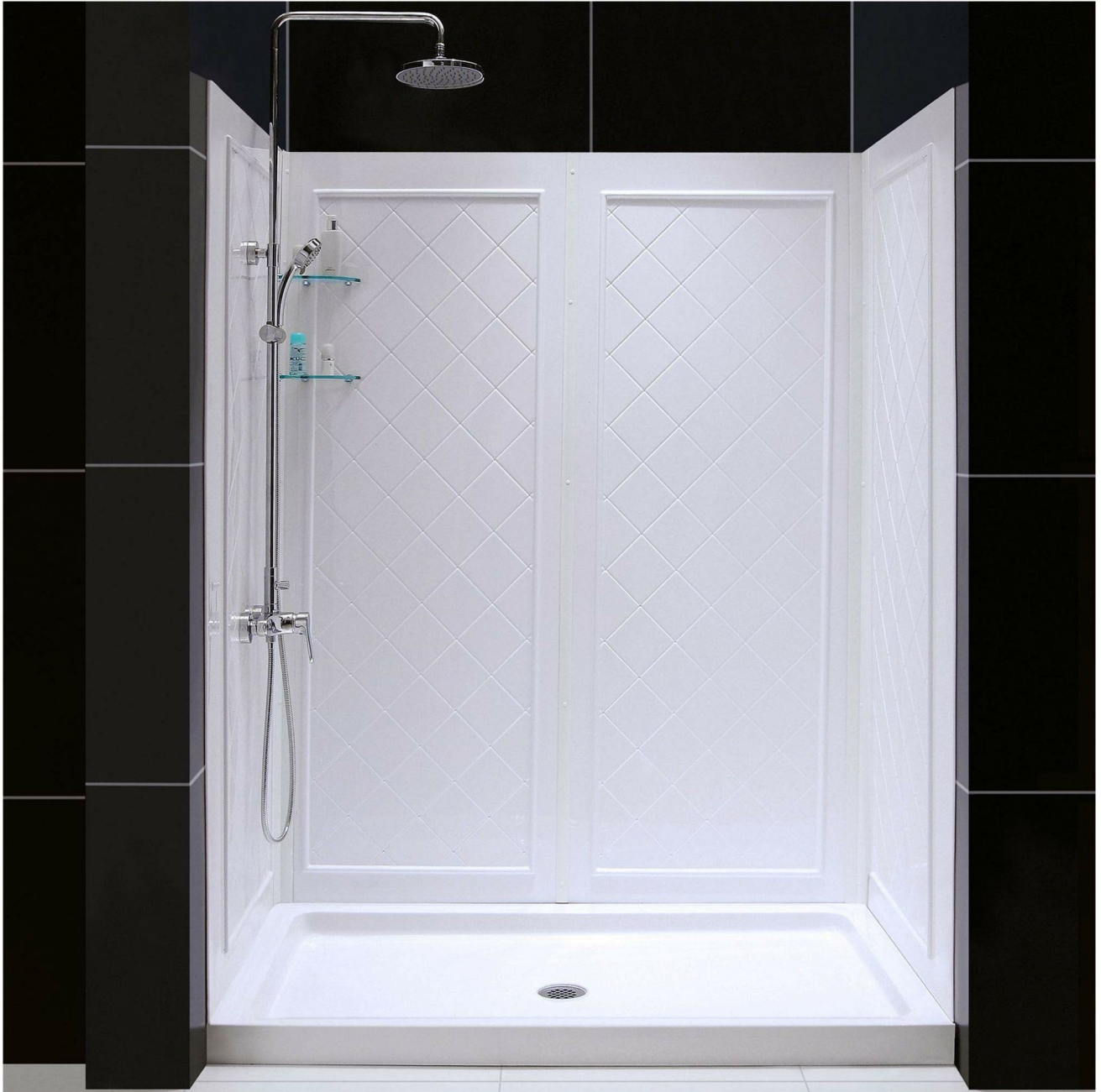
Figure 2: DreamLine SlimLine Center Drain Shower Base. This image displays the white acrylic shower base with a textured floor and a central drain opening.