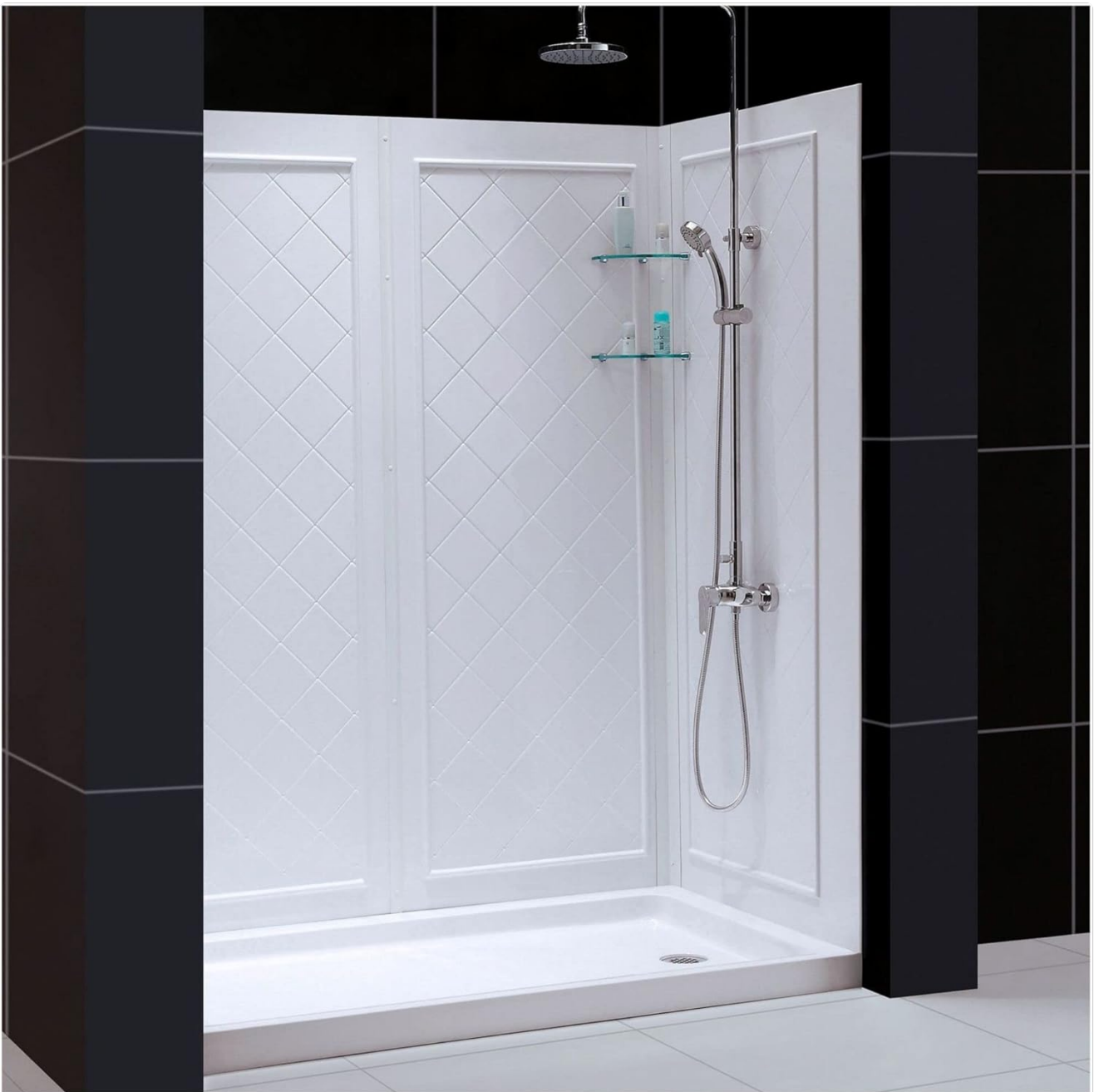
Figure 1: DreamLine Shower Base and QWALL-5 Backwall Kit installed. This image shows the complete shower system with the white acrylic base and patterned backwalls.