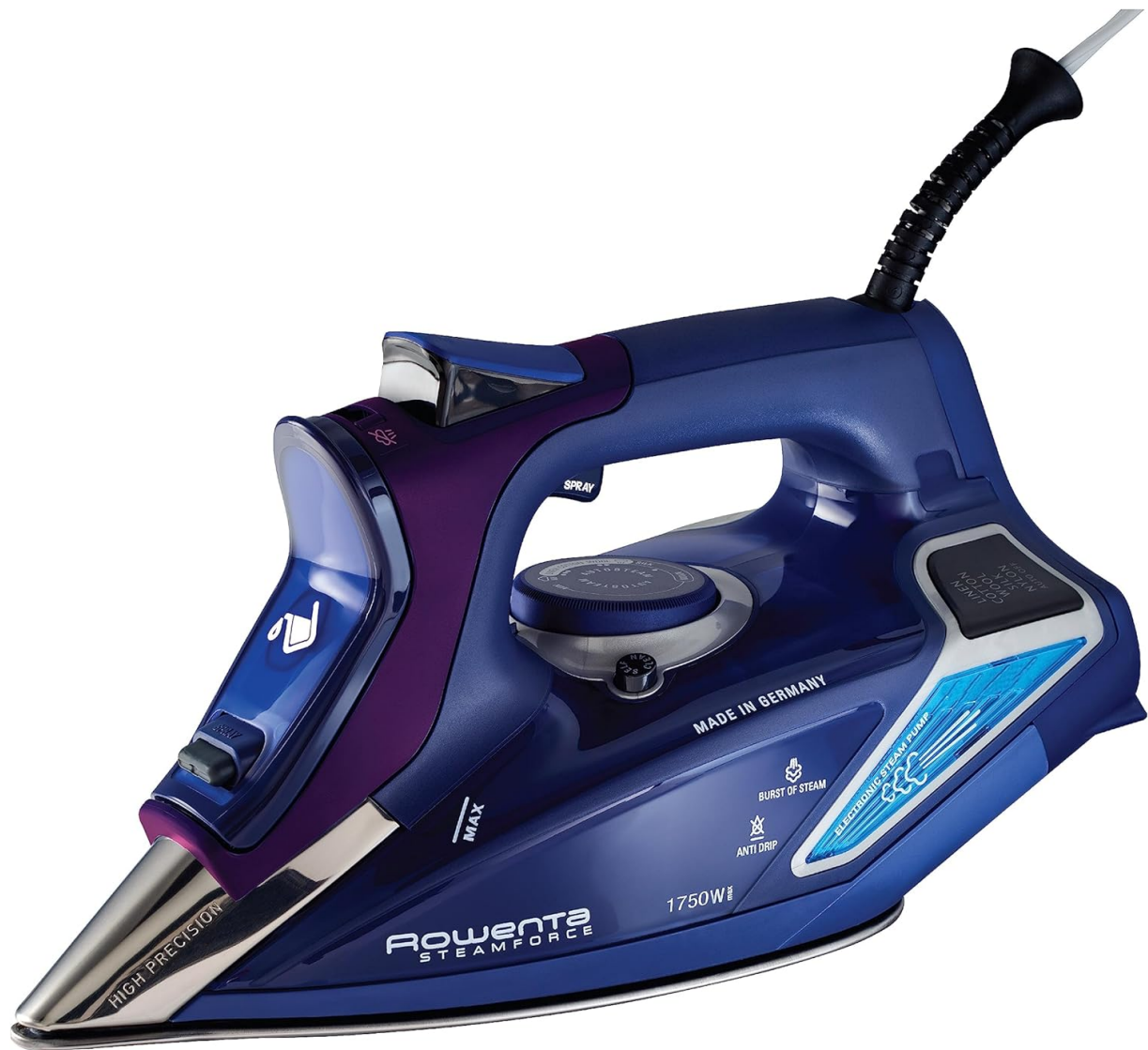
Image: The Rowenta Steam Force DW9280 iron, showcasing its sleek design and blue finish.