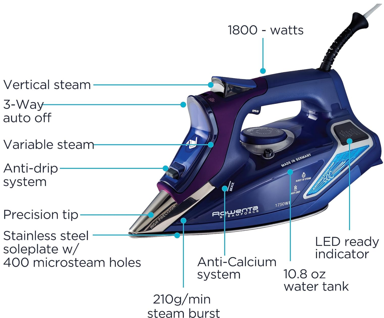
Image: Diagram of the Rowenta Steam Force DW9280 iron highlighting key features like the water tank, steam controls, and soleplate.