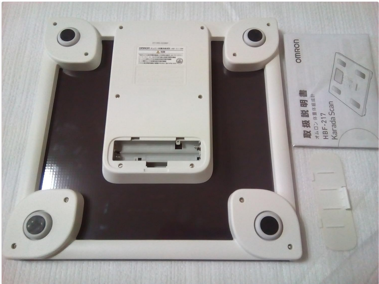
Image: The battery compartment located on the bottom of the device, ready for battery insertion.