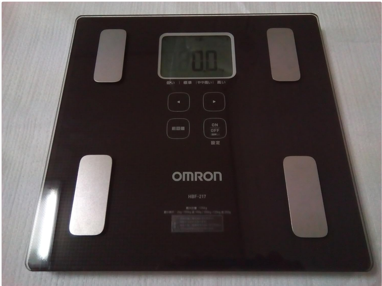
Image: The top surface of the OMRON HBF-217-BW Body Composition Monitor, showing the display and the four electrode pads for foot placement.