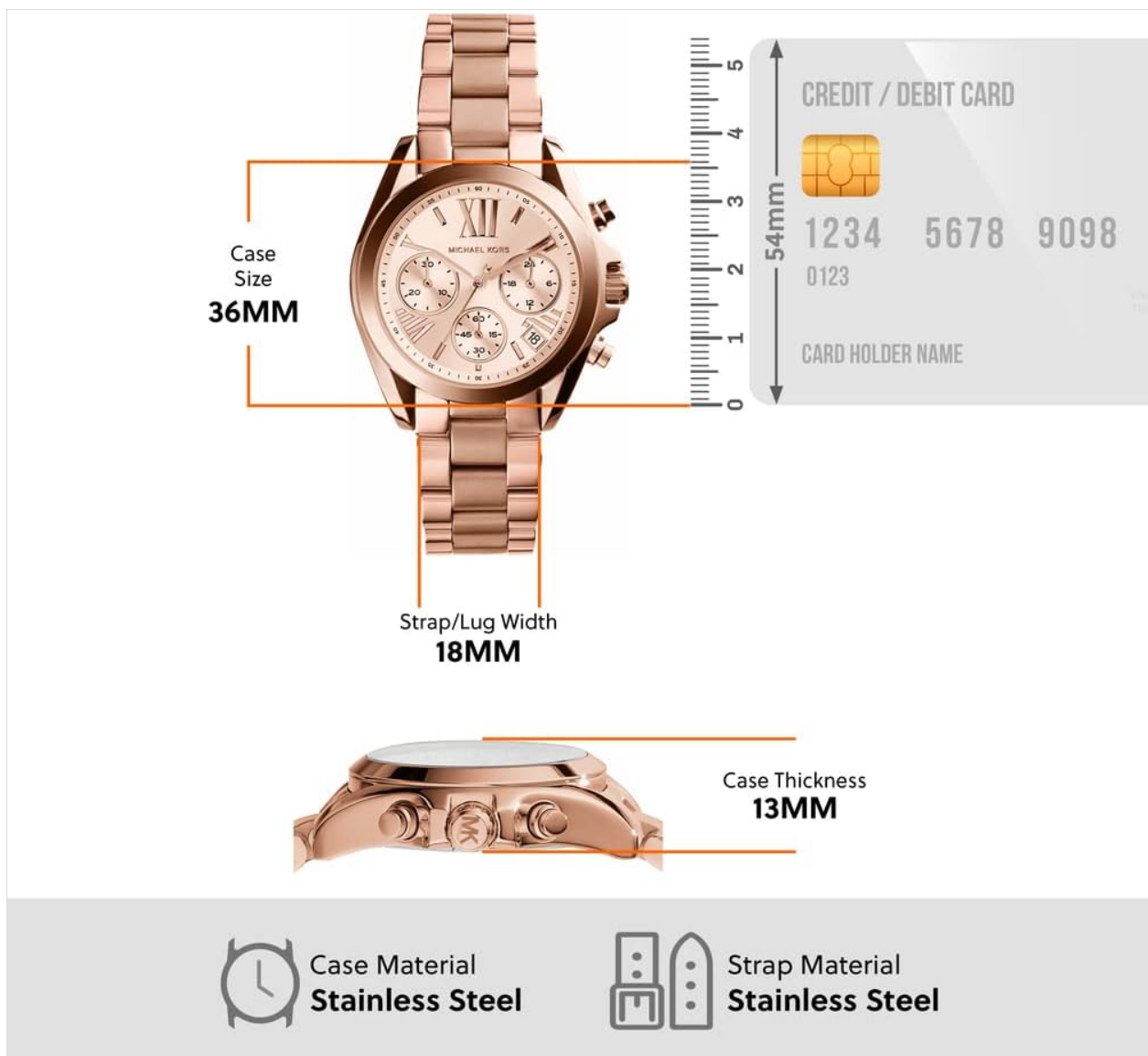
Image: Diagram illustrating the watch's dimensions, including case size (36mm) and strap/lug width (18mm), relevant for bracelet adjustments.

The stainless steel bracelet links can be removed or added for a customized fit. This procedure should be performed by a professional watchmaker to prevent damage to the bracelet or watch.