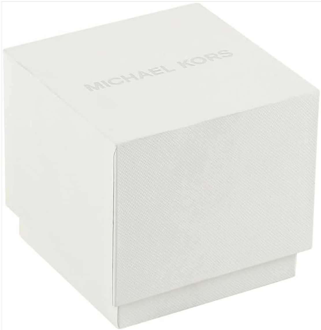
Image: The Michael Kors watch box, indicating the product's original packaging.