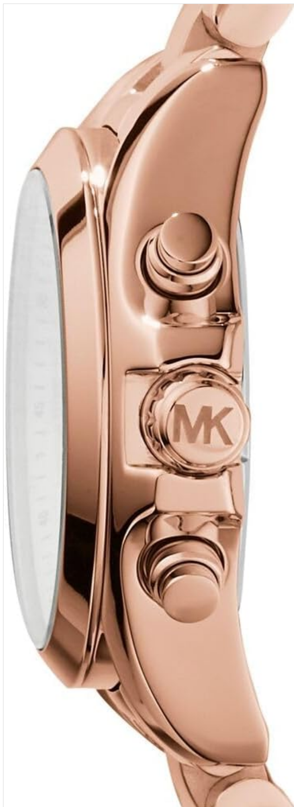
Image: Side view of the watch, highlighting the crown and chronograph pushers for setting and operation.