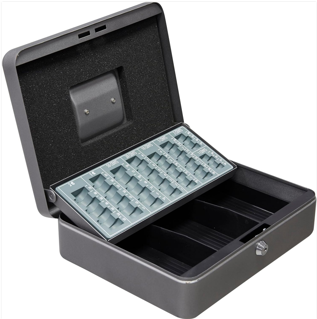
An open ARREGUI C9246-EUR cash box, showing the grey coin tray tilted upwards, revealing the empty banknote compartments below. The interior lid has a black foam lining.