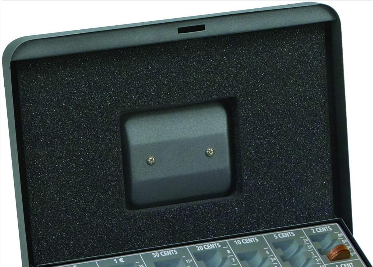
The ARREGUI C9246-EUR cash box, open and displaying its contents, placed on a dark table in a modern room setting.