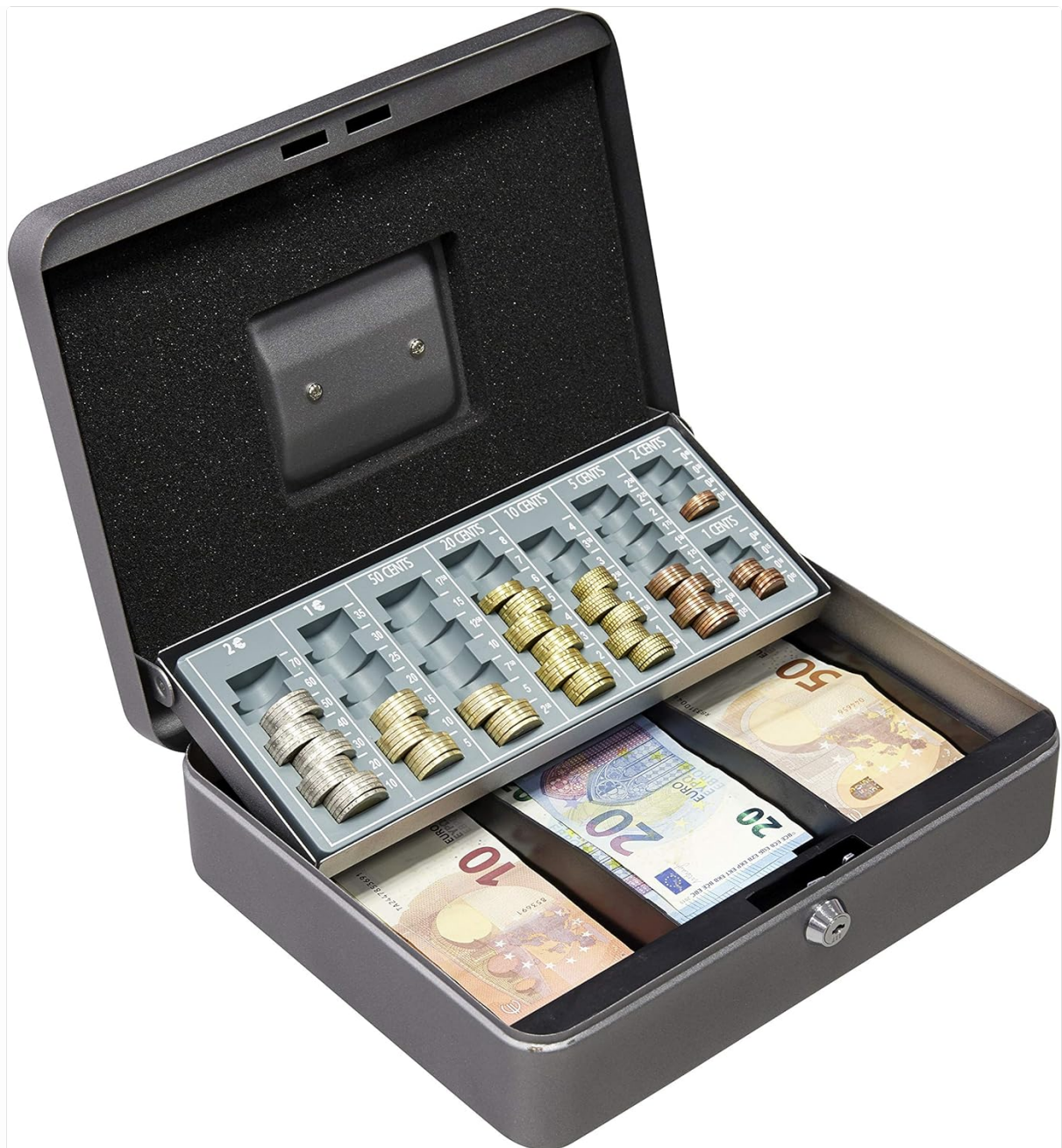
An open ARREGUI C9246-EUR cash box, showing the grey Euro coin tray filled with various denominations of coins, and three compartments below holding Euro banknotes. The interior lid has a black foam lining.