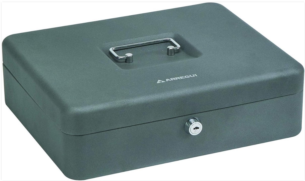
A closed ARREGUI C9246-EUR cash box in graphite grey, featuring a top handle and a keyhole on the front. The ARREGUI logo is visible on the lid.