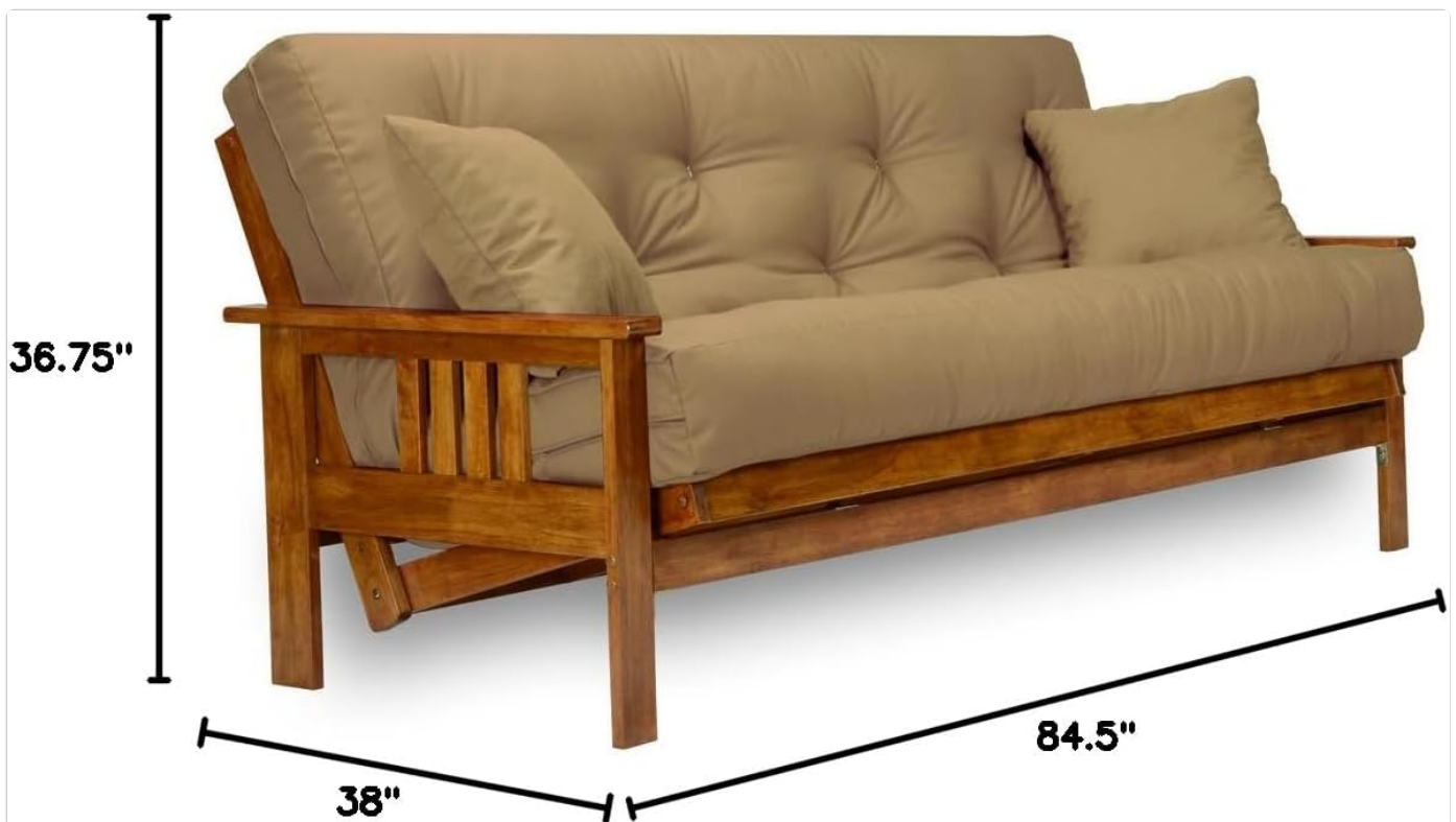
Figure 2: Product dimensions for planning your space.