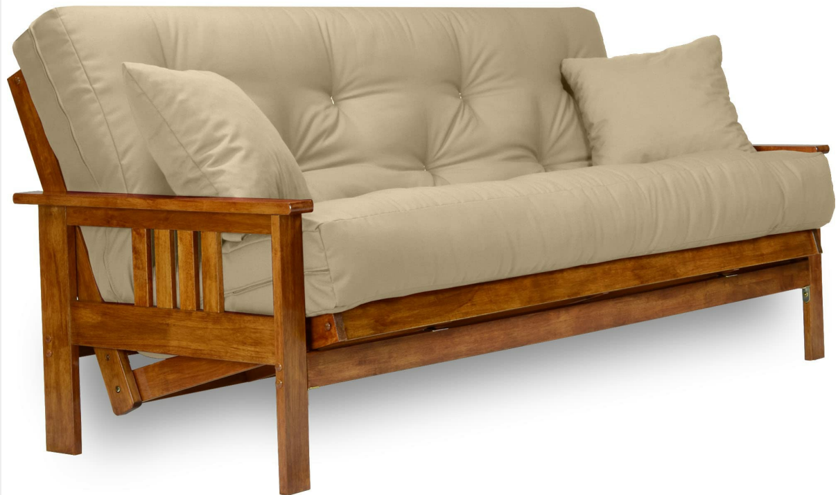
Image: The Nirvana Futons Stanford Queen Futon Set in its sofa configuration, featuring a solid wood frame and a khaki-colored mattress.