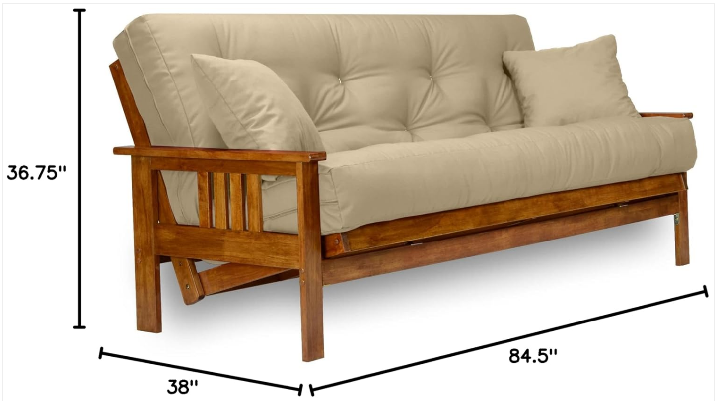
Image: A diagram illustrating the key dimensions of the futon set in sofa position: 38"D x 84.5"W x 36.75"H.