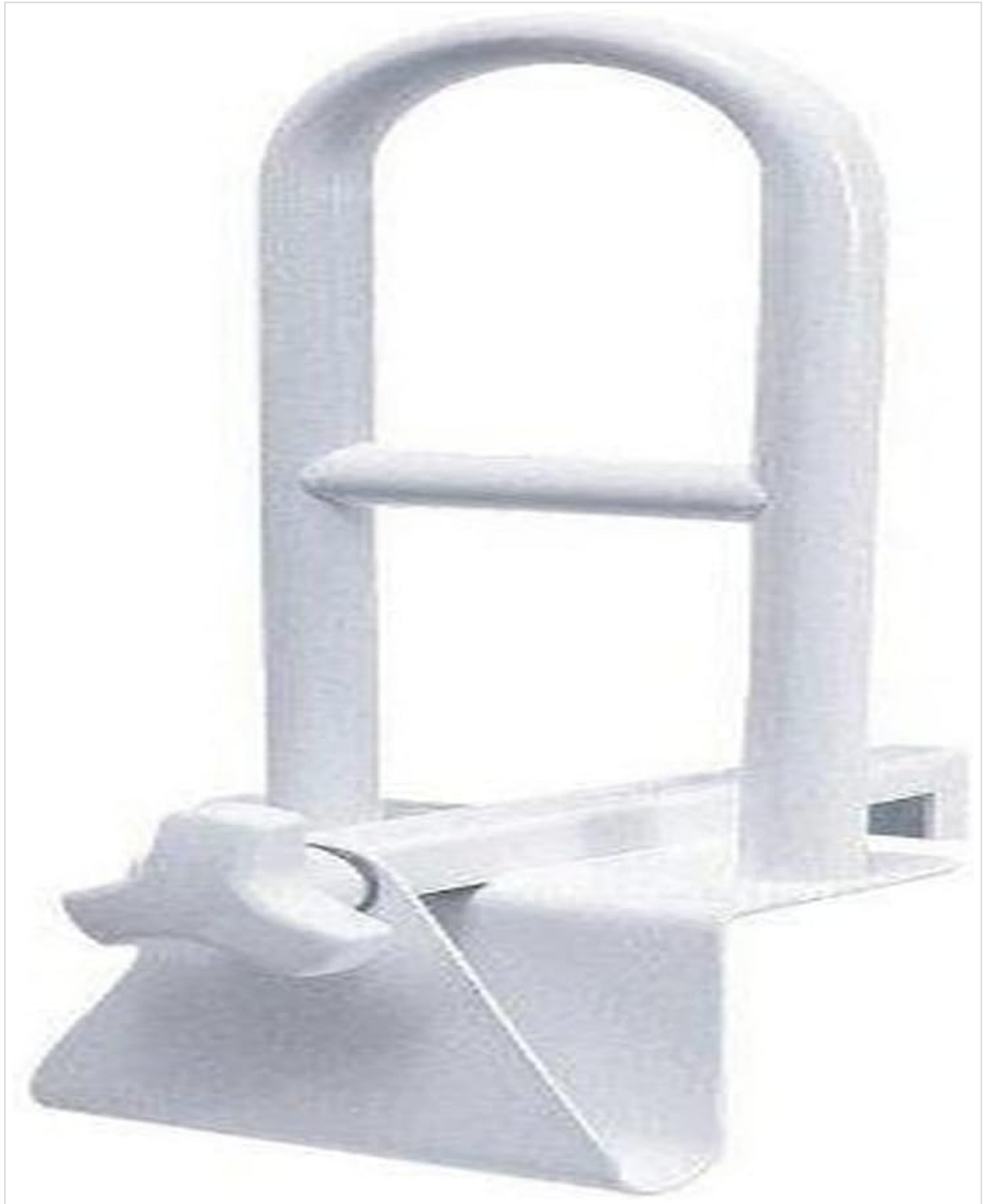
Image: The Medline Bathtub Grab Bar, illustrating its design for easy installation on a tub rim.