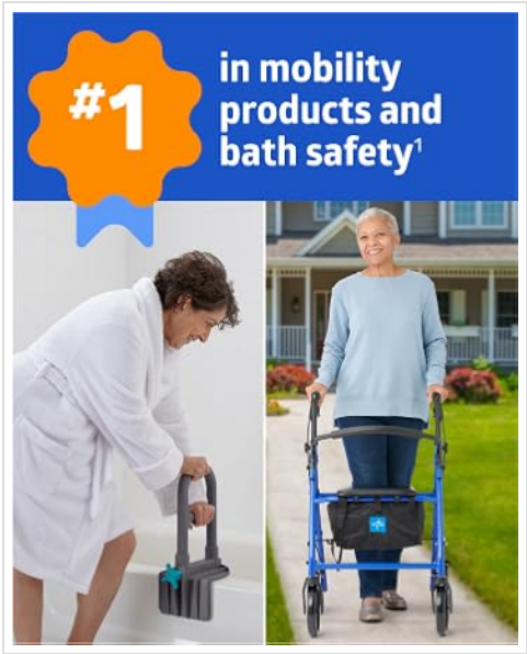
Image: A user demonstrating the safe use of a bathtub grab bar for support while entering the tub.