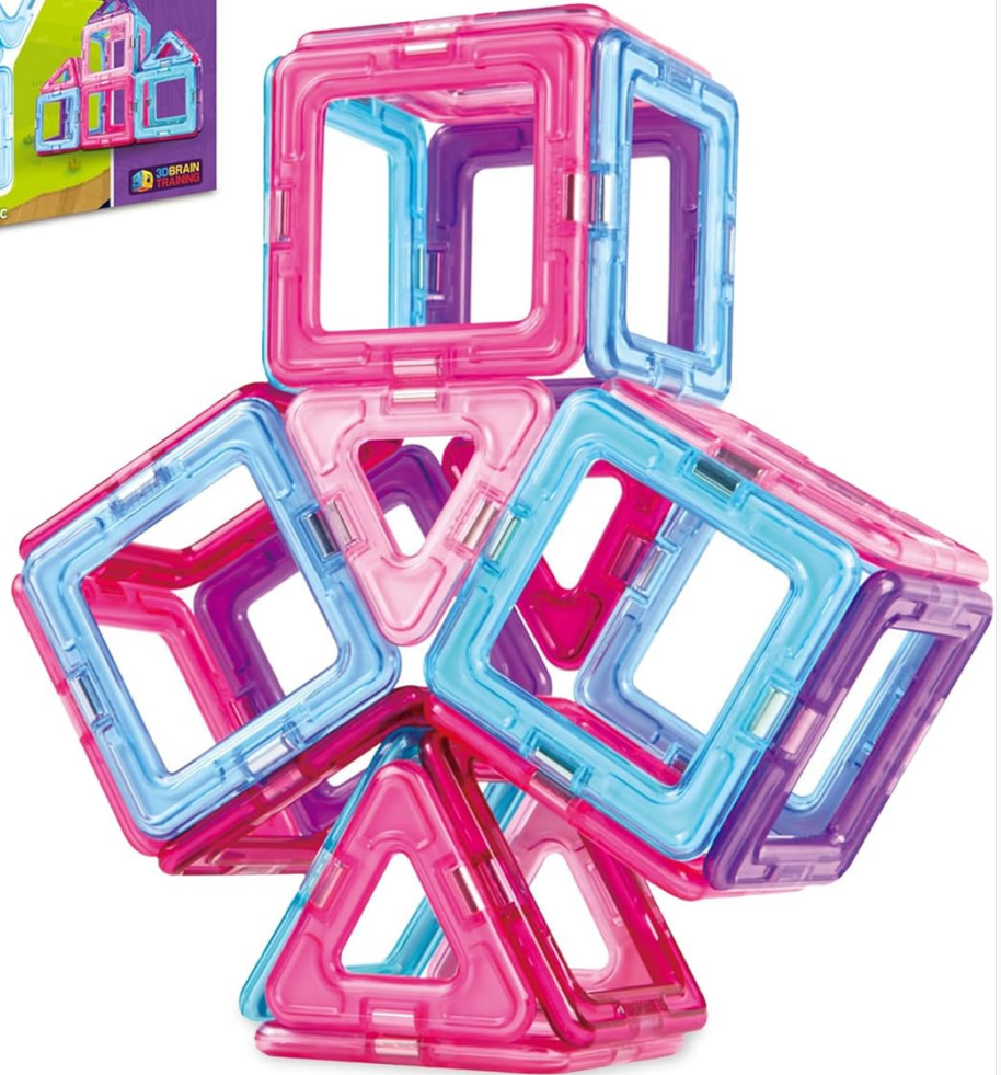
Image 1.1: The Magformers Inspire 30-Piece Set packaging alongside a vibrant, multi-faceted geometric structure built using the magnetic tiles. The set includes squares and triangles in pink, purple, and blue.