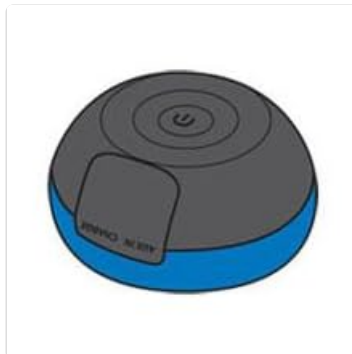
Image: A close-up view of the JAM XT Extreme speaker's base, highlighting the power button for easy access.

Locate the power button on the bottom of the unit. Press and hold the power button for a few seconds to turn the speaker ON or OFF. A sound prompt will indicate the power status.