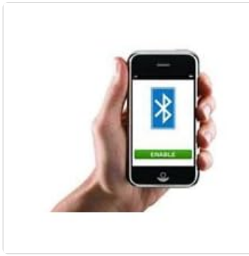
Image: A visual representation of the speaker connecting wirelessly to a device via Bluetooth.