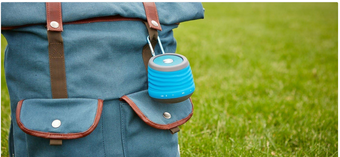
Image: The blue JAM XT Extreme speaker securely clipped to a backpack, showcasing its design for convenient outdoor use.

The integrated fold-out carabiner clip allows for easy attachment to backpacks, bags, belt loops, or even hanging from a tree branch or tent for optimal sound projection and portability.