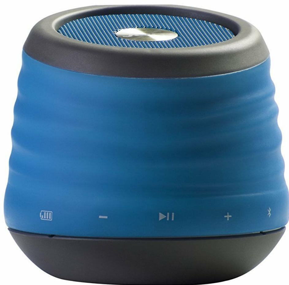
Image: The JAM XT Extreme Wireless Speaker in blue, featuring its durable design and integrated carabiner clip for portability.