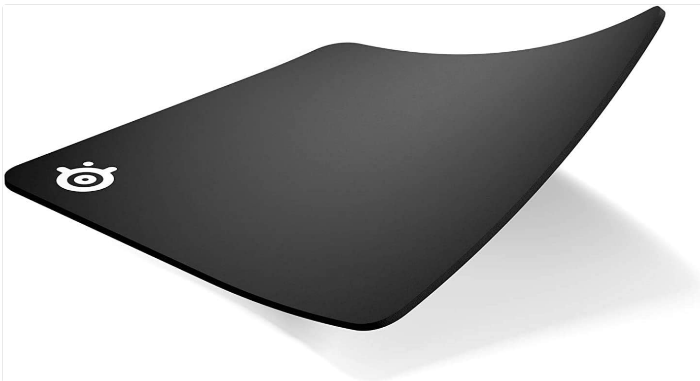
Image: Top view of the SteelSeries QcK Heavy Mouse Pad, showcasing its large, black surface and the SteelSeries logo in the corner.

The SteelSeries QcK Heavy mouse pad is designed for esports professionals, featuring a legendary micro-woven fabric surface that optimizes mouse tracking precision for both optical and laser sensors. Its high thread density and smooth surface ensure consistent and accurate mouse movements. This durable and washable mouse pad is easy to clean and maintain, providing a reliable gaming surface.