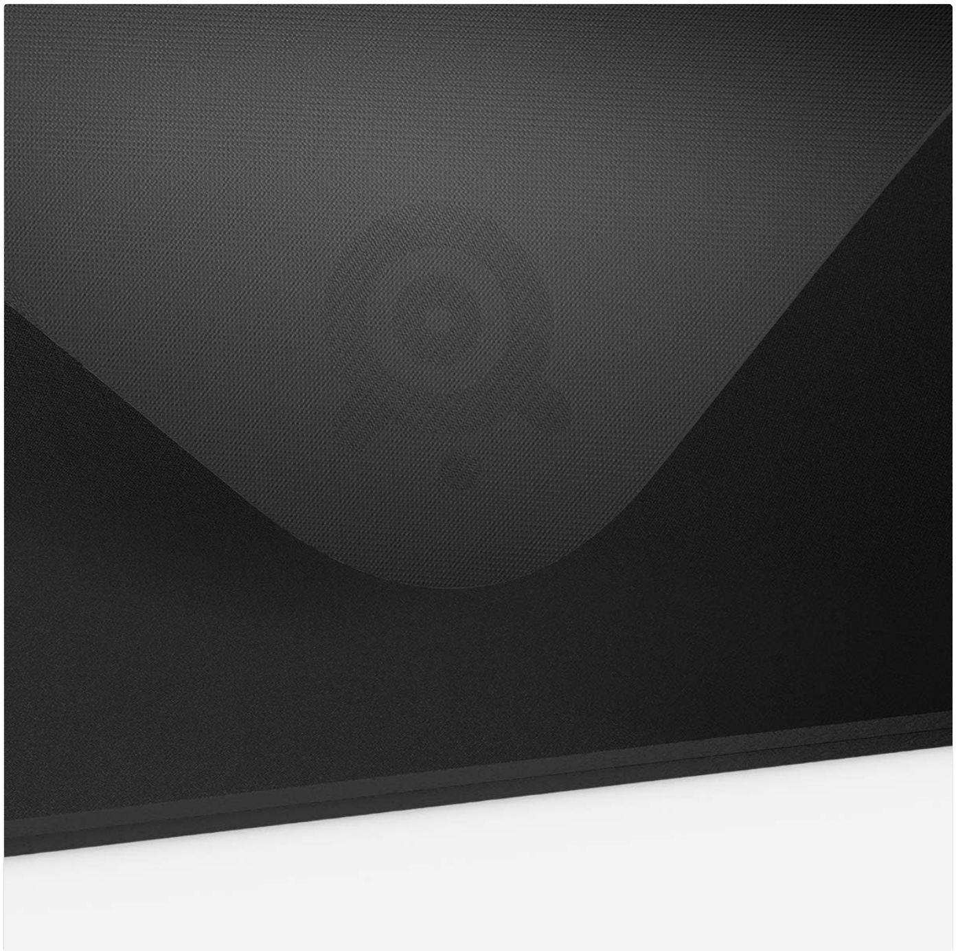
Image: A close-up view of the micro-woven fabric surface of the SteelSeries QcK Heavy Mouse Pad, highlighting its texture.