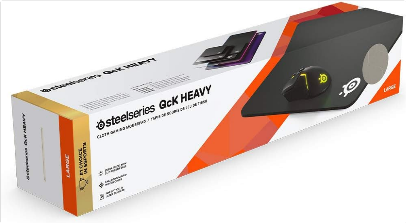
Image: The SteelSeries QcK Heavy Mouse Pad shown in its retail packaging.