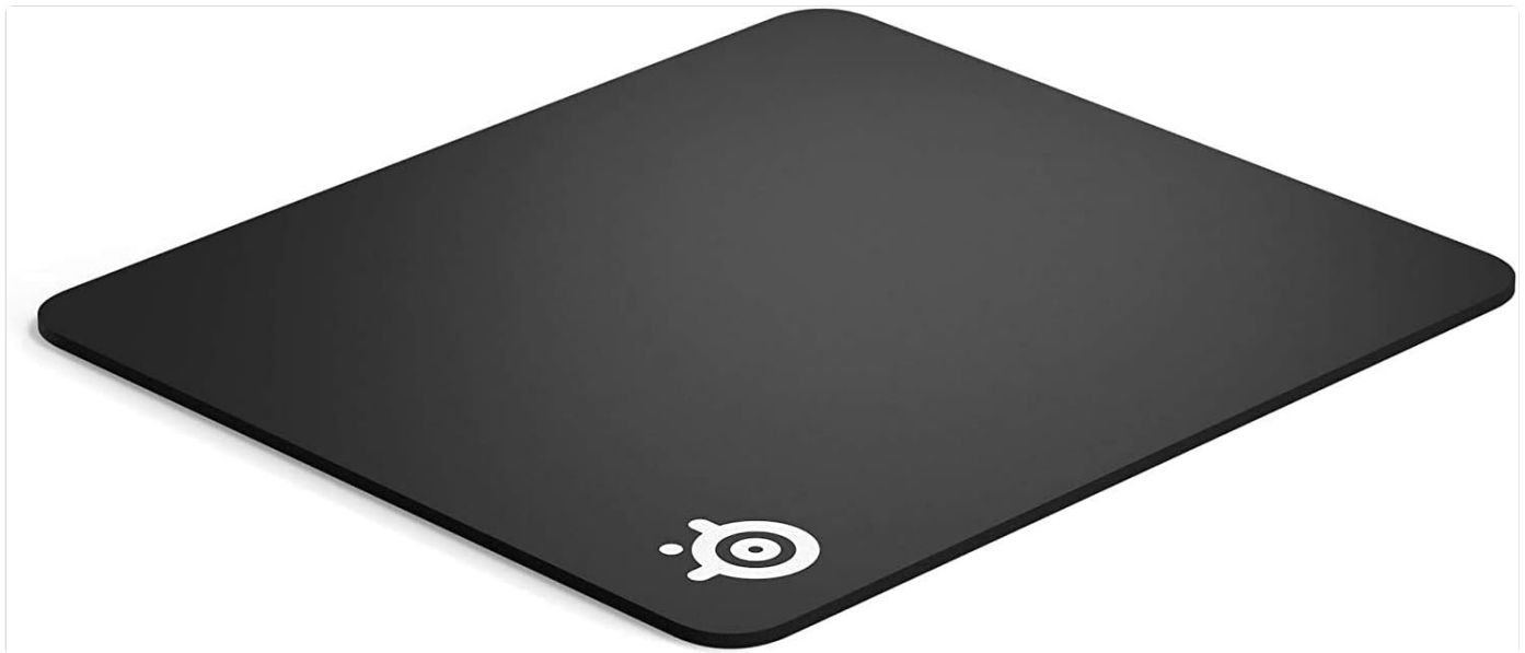
Image: The SteelSeries QcK Heavy Mouse Pad laid flat on a desk, ready for use.