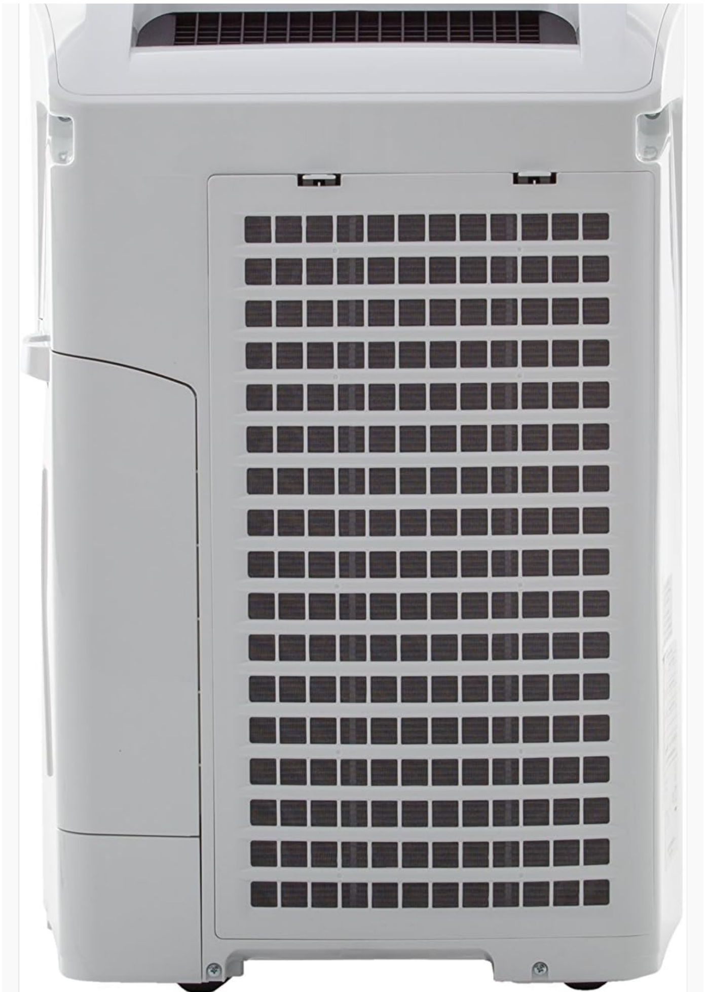
Figure 3.1: Side view of the air purifier, showing the air intake grille. Ensure this area is unobstructed.