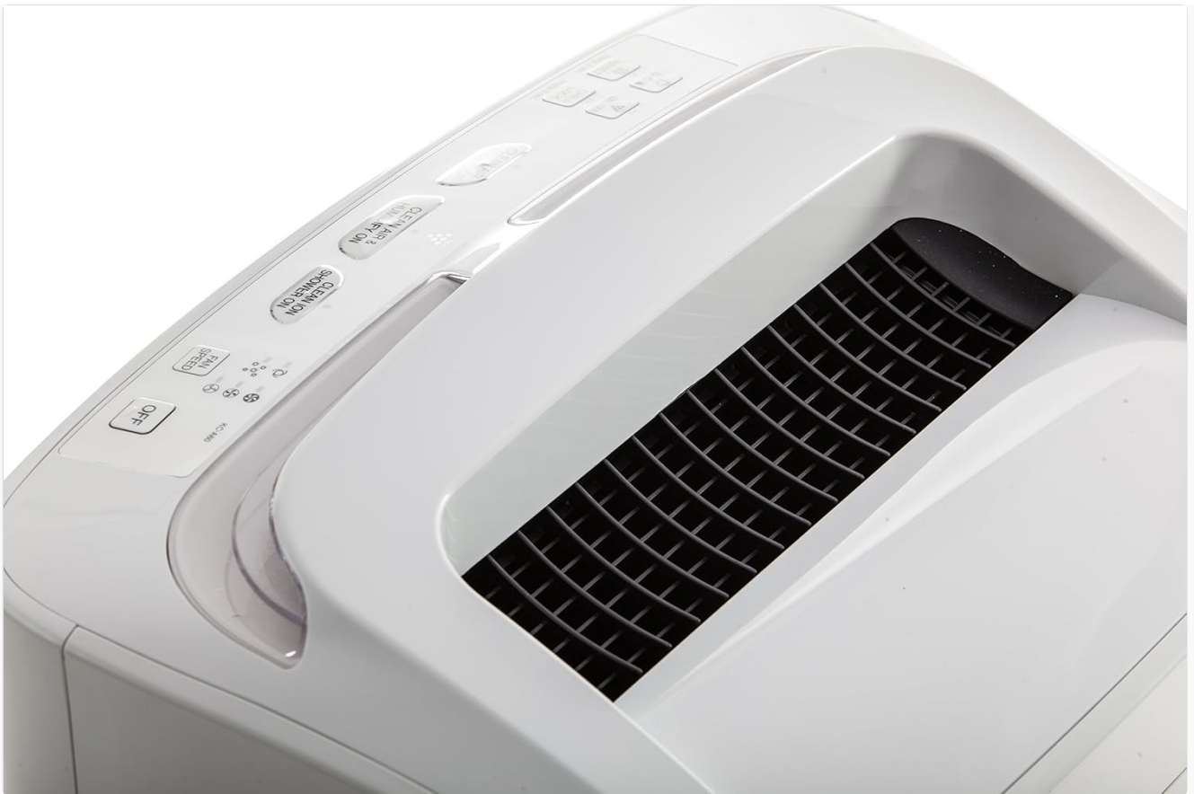
Figure 2.1: Front view of the Sharp KC-A50EU-W Air Purifier, showing the main body and air outlet.