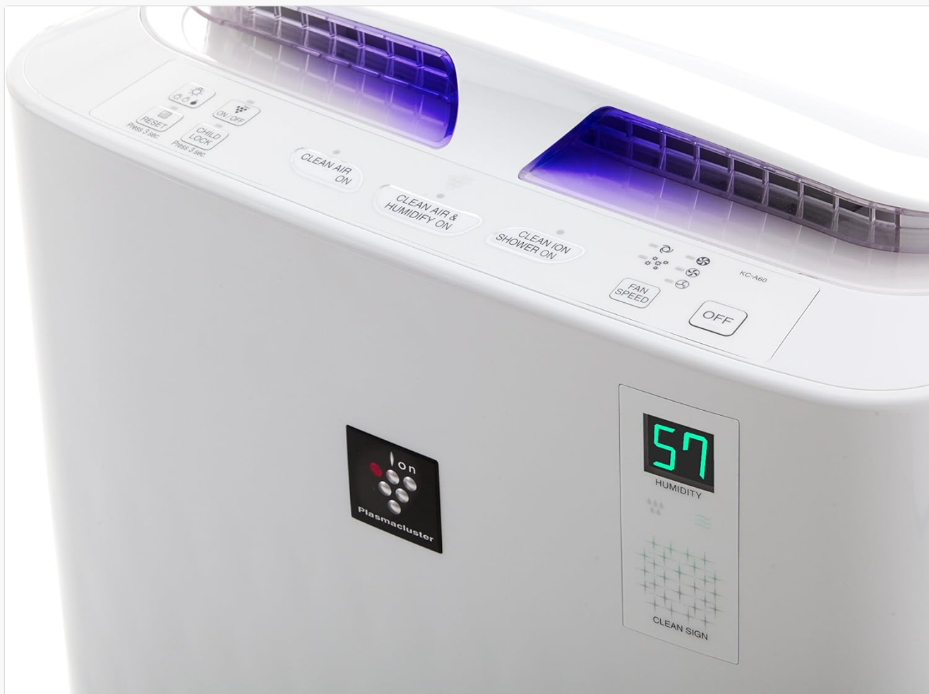
Figure 4.1: Close-up of the control panel, showing buttons for power, fan speed, Plasmacluster, and humidification.

The control panel allows you to manage the various functions of your air purifier.