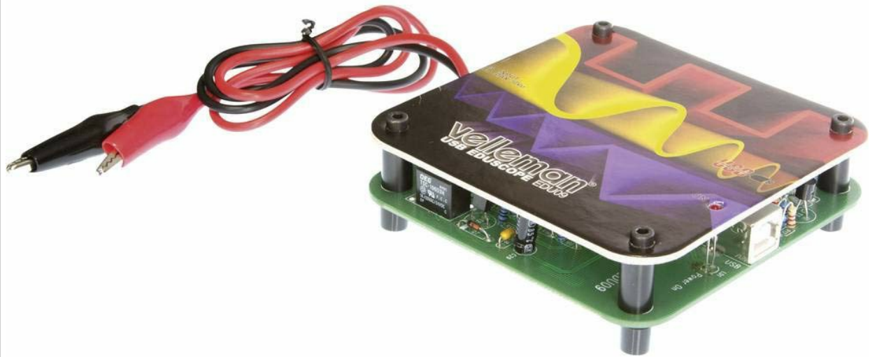
Figure 3: An angled view of the Velleman EDU09 kit, showcasing the USB port on the side for PC connection and the internal circuit board components.