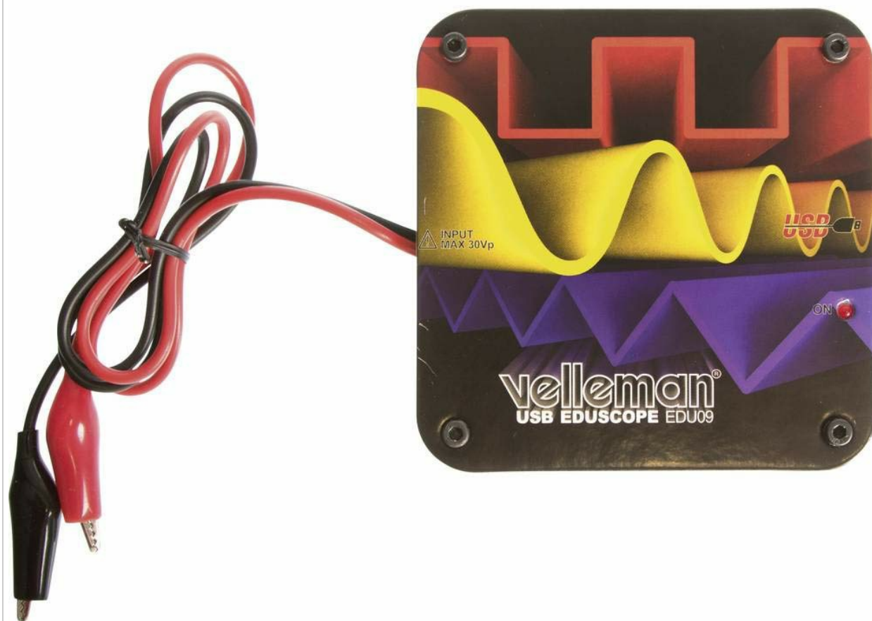
Figure 1: The assembled Velleman EDU09 PC Oscilloscope Kit, showing the main unit connected to red and black test leads with alligator clips.