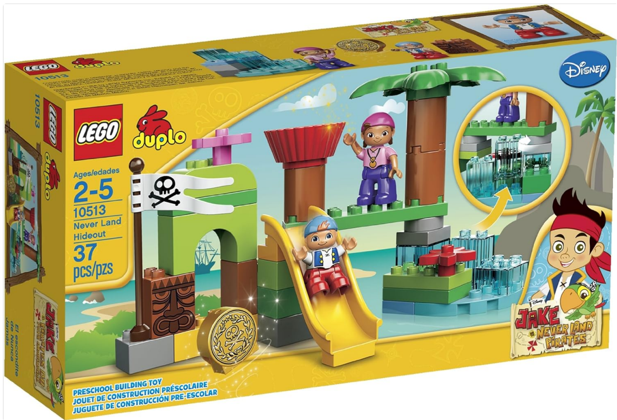
Image: The complete LEGO DUPLO Never Land Hideout 10513 set, as depicted on its packaging. It showcases the main structure with a slide, a lookout tower, and the Izzy and Cubby figures.