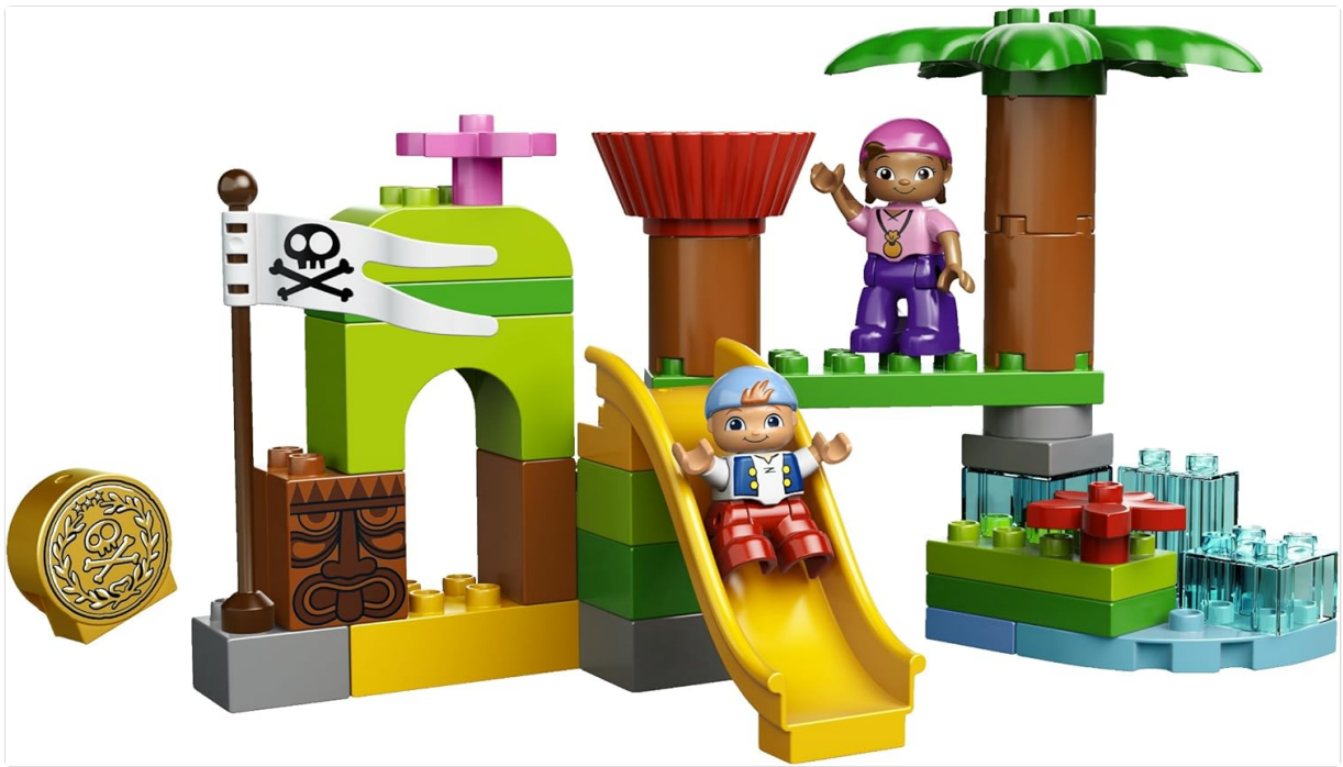
Image: The fully assembled LEGO DUPLO Never Land Hideout, showcasing the slide, lookout tower, pirate flag, and the Izzy and Cubby figures ready for play.