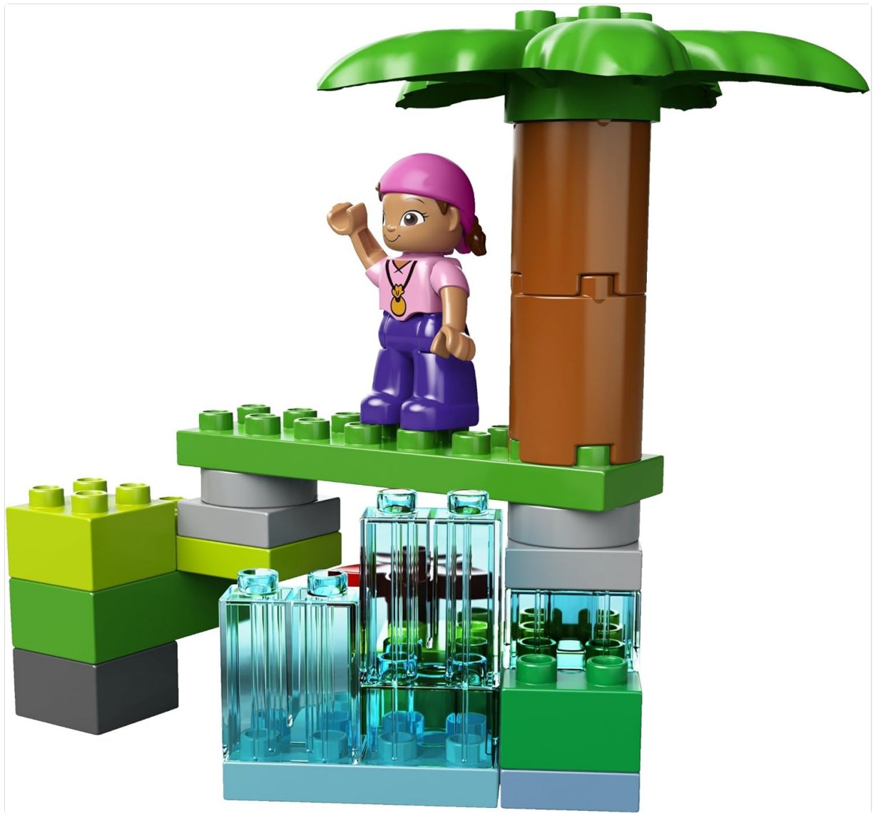
Image: A detailed view of the Izzy figure positioned on an elevated platform, next to a palm tree, highlighting the vertical play possibilities within the hideout.