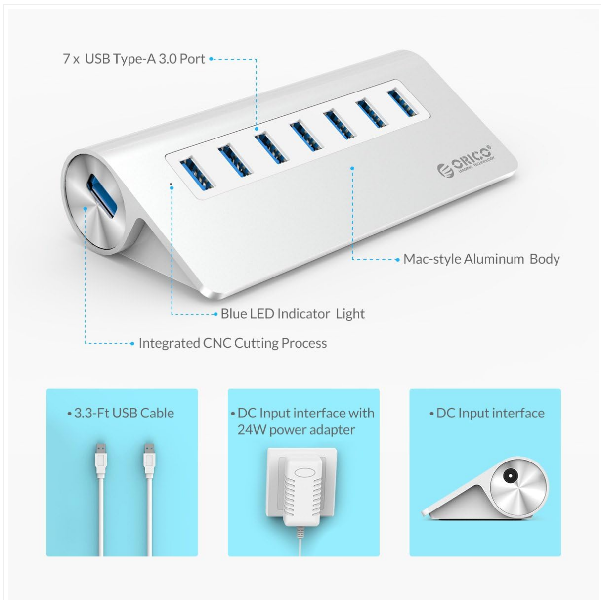
Figure 1: Overview of the ORICO 7-Port USB 3.0 Hub with labeled ports, highlighting the 7 USB Type-A 3.0 ports, blue LED indicator, and integrated CNC cutting process.