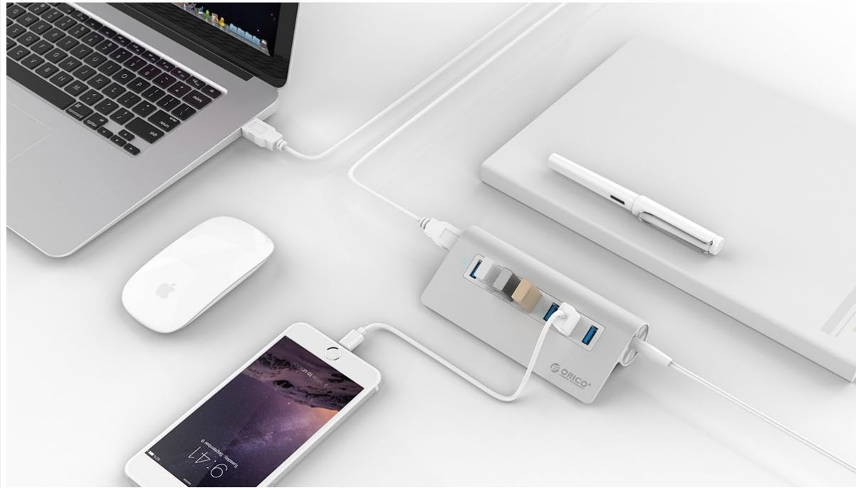
Figure 2: The essential accessories included with your hub: a 3.3-foot USB cable for connecting to your computer and a 24W power adapter for stable power supply.