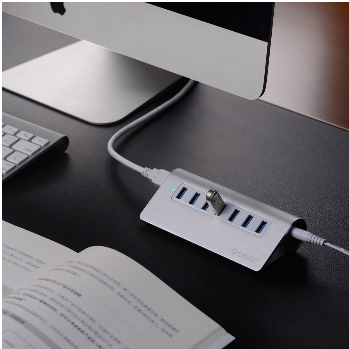
Figure 5: The ORICO hub seamlessly integrated into a desktop setup, connected to a laptop and managing various peripherals, showcasing its sleek Apple-style aluminum finish.

Your browser does not support the video tag.