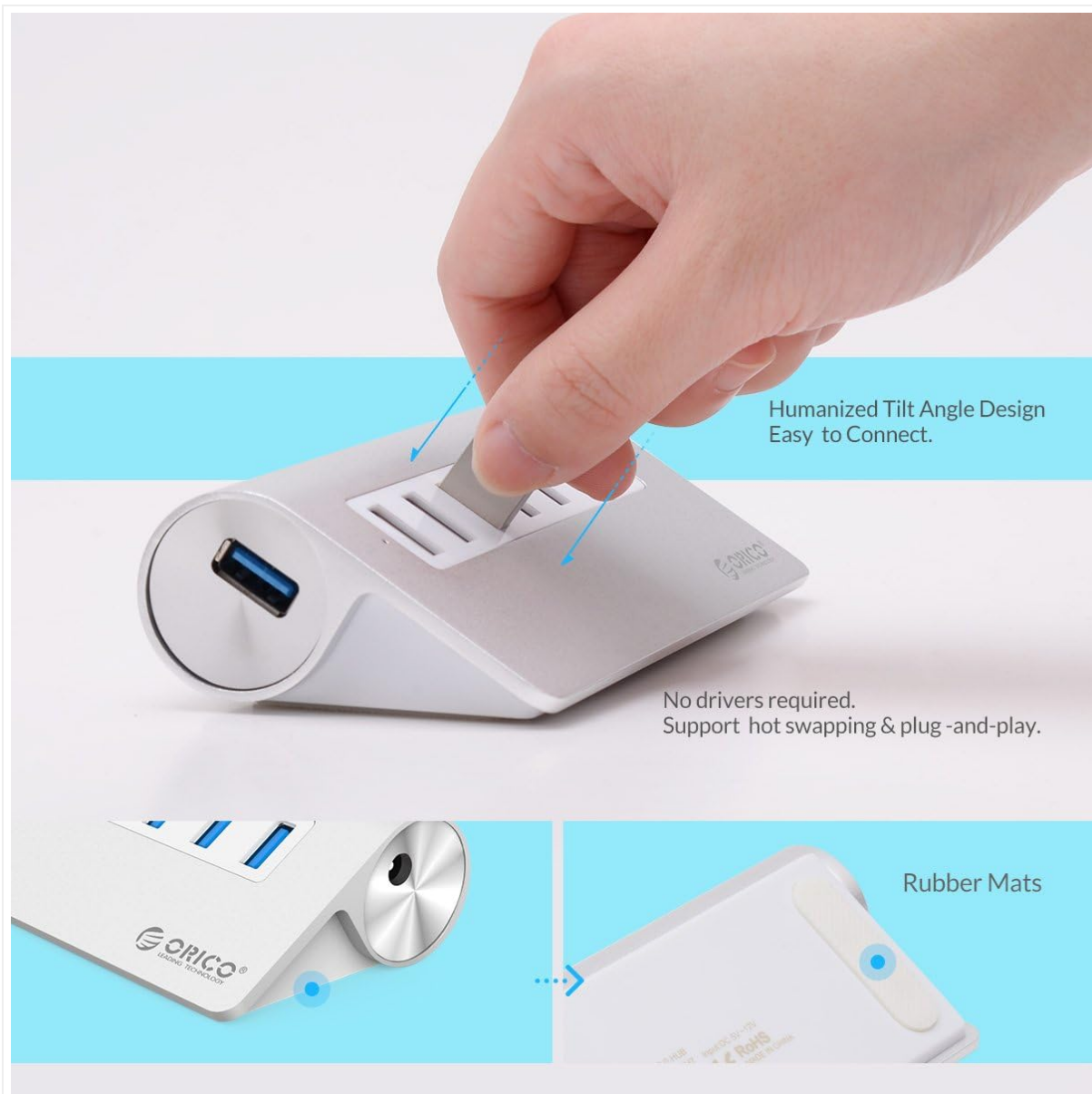
Figure 4: A detailed view of the hub's humanized tilt angle design, which facilitates effortless plugging and unplugging of USB devices.