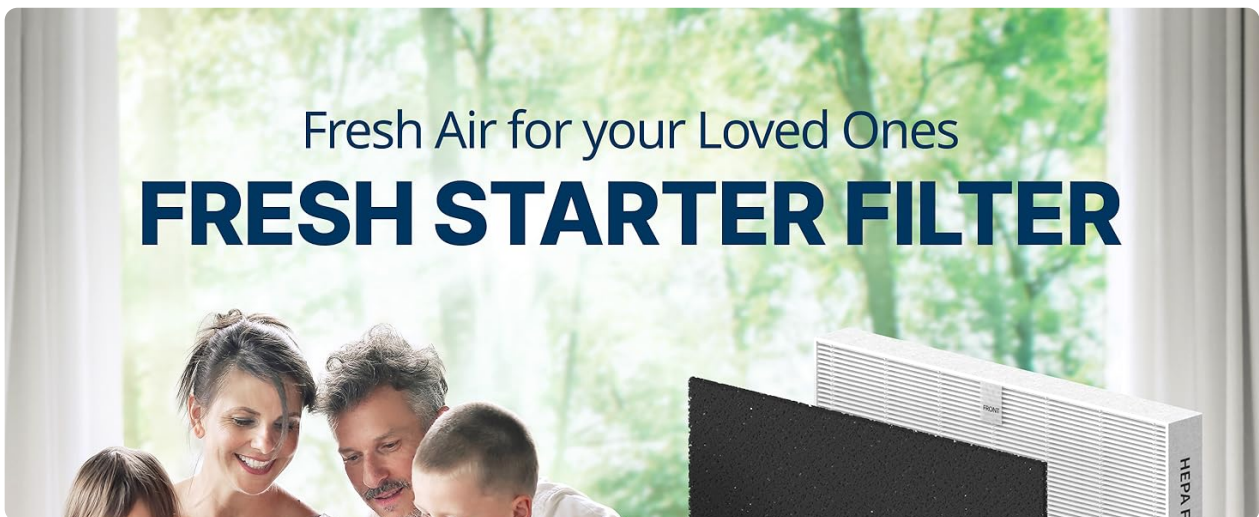
Image: A family enjoying clean, fresh air in their home, illustrating the benefit of using the Coway Airmega air purifier with its effective filters.

The True HEPA filter is engineered to capture 99.97% of airborne allergens and contaminants as small as 0.3 microns, including pollen, pet dander, household dust, and tobacco smoke. The Carbon Deodorization filters effectively eliminate odors and harmful gases from the air.