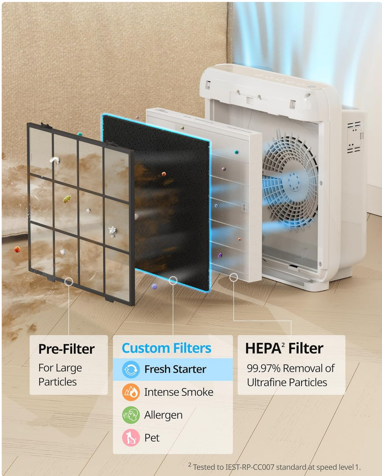
Image: An exploded view diagram illustrating the different filter layers within the Coway Airmega air purifier, including the Pre-Filter, Custom Filters, and HEPA2 Filter.