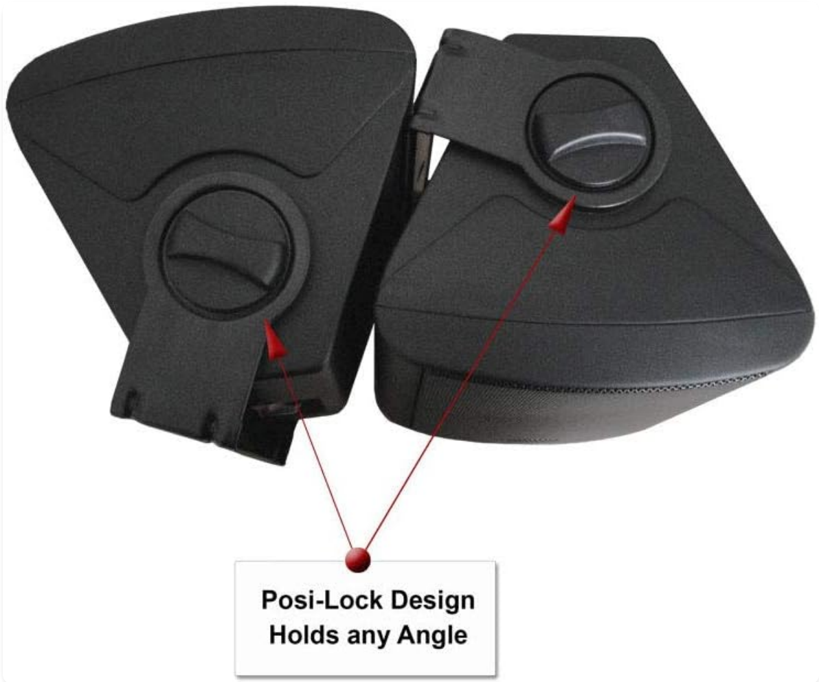
Image: Rear view of both speakers, illustrating the power input, speaker output terminals, and mounting points.

Your browser does not support the video tag.