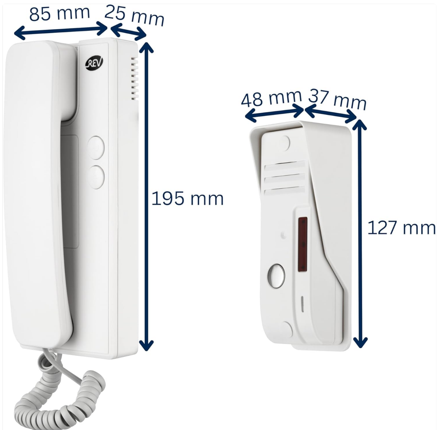
Figure 8: Dimensions of the intercom units.