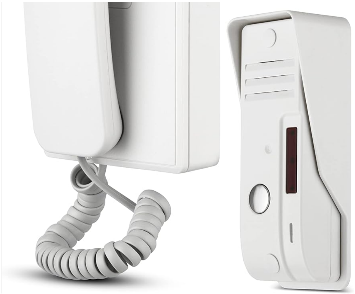
Figure 1: Overview of the REV ritter 003003101 Intercom System components.