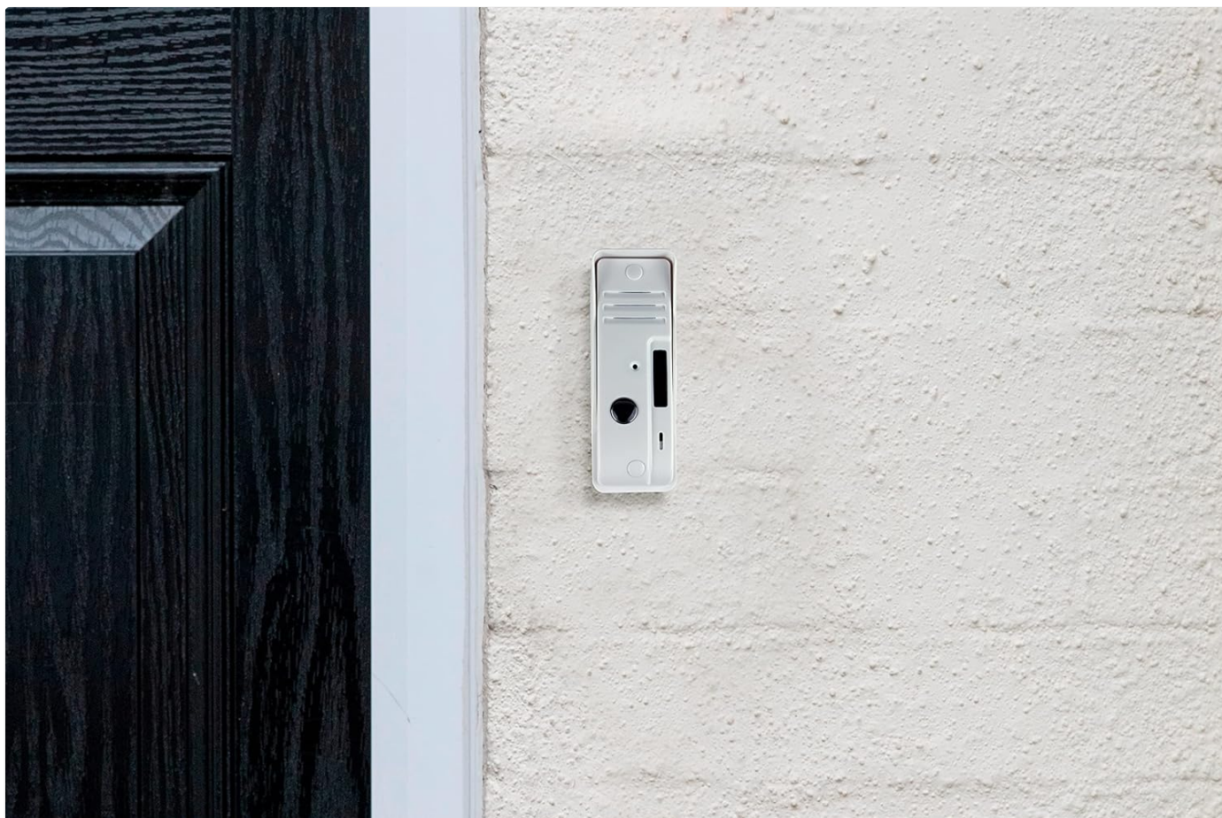
Figure 3: Example of outdoor unit placement next to a door.