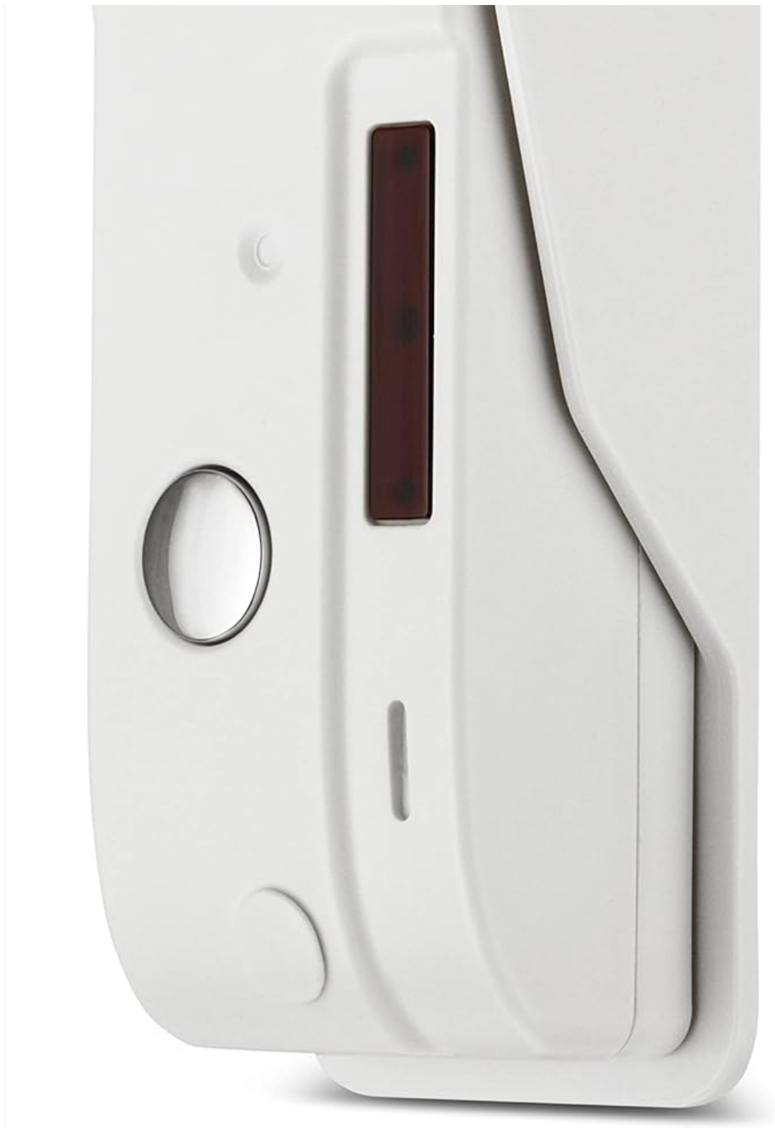
Figure 5: Outdoor unit with call button.