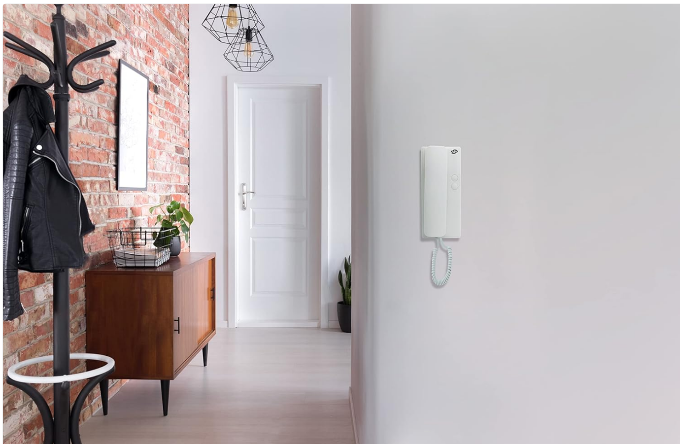
Figure 2: Example of indoor unit placement in a home hallway.