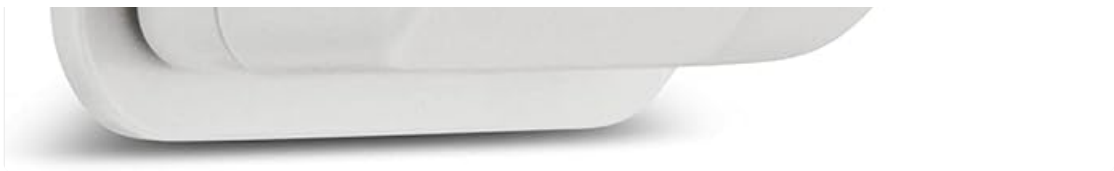
Figure 6: Outdoor unit speaker and microphone area.