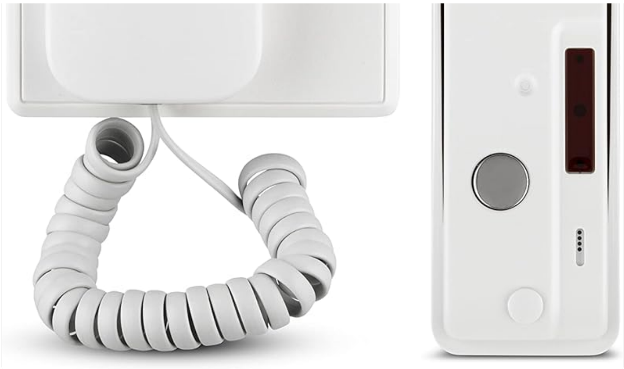
Figure 7: Indoor unit with communication and door release buttons.