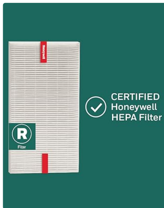
Figure 2: Certified HEPA filtration captures microscopic airborne allergens and particles.