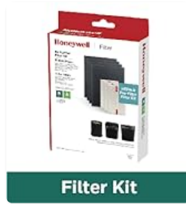
Figure 8: Pre-filter replacement reminder.