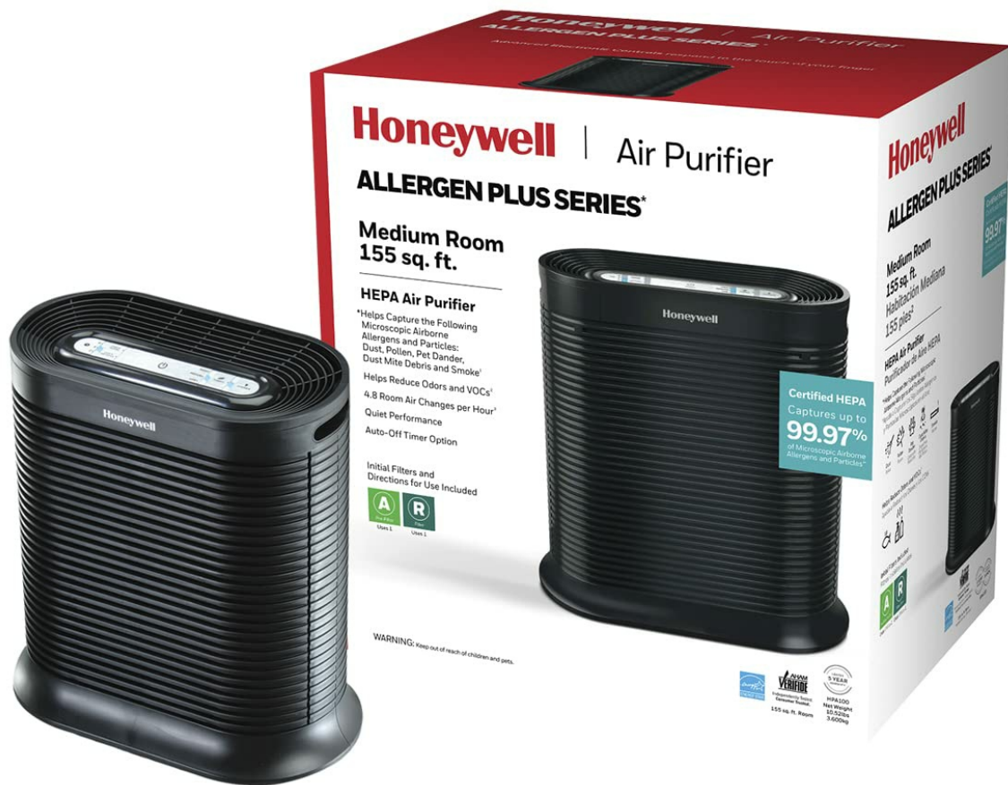
Figure 1: Honeywell HPA100 HEPA Air Purifier in a typical room setting.