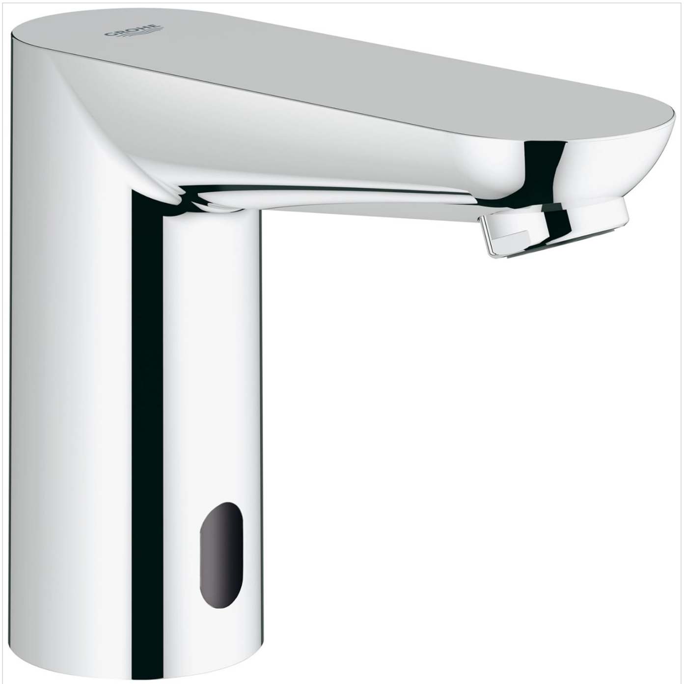
Figure 1: Front view of the Grohe Euroeco Cosmopolitan E Single Hole Touchless Electronic Bathroom Faucet in Starlight Chrome finish.