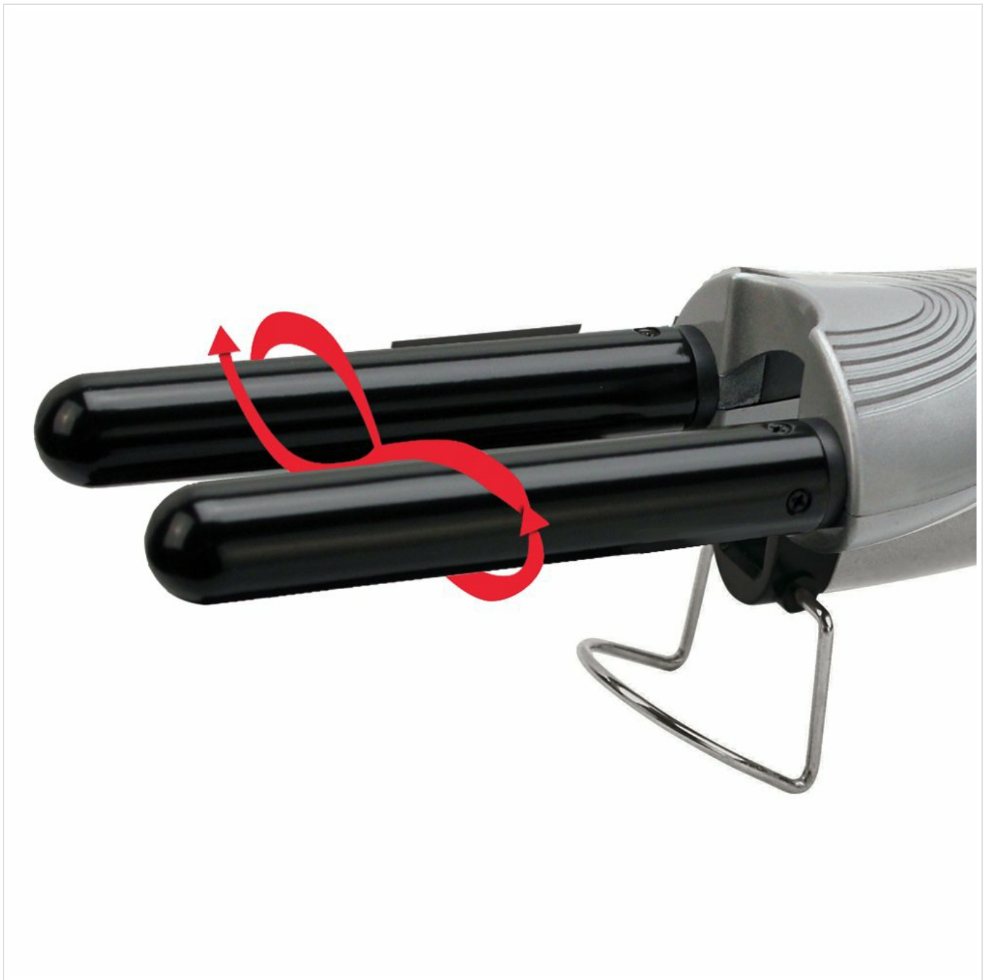
Image: Close-up view of the waver barrels, illustrating the rotational movement required to attach or detach the interchangeable barrels.