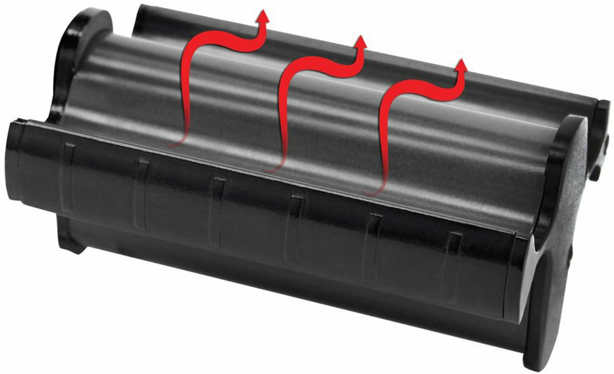
Image: One of the interchangeable barrels, designed to create deep, defined waves.