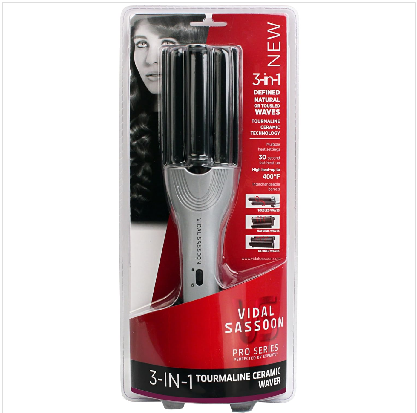
Image: The Vidal Sassoon 3-in-1 Tourmaline Waver, showcasing the three different interchangeable barrel types for varied wave styles.