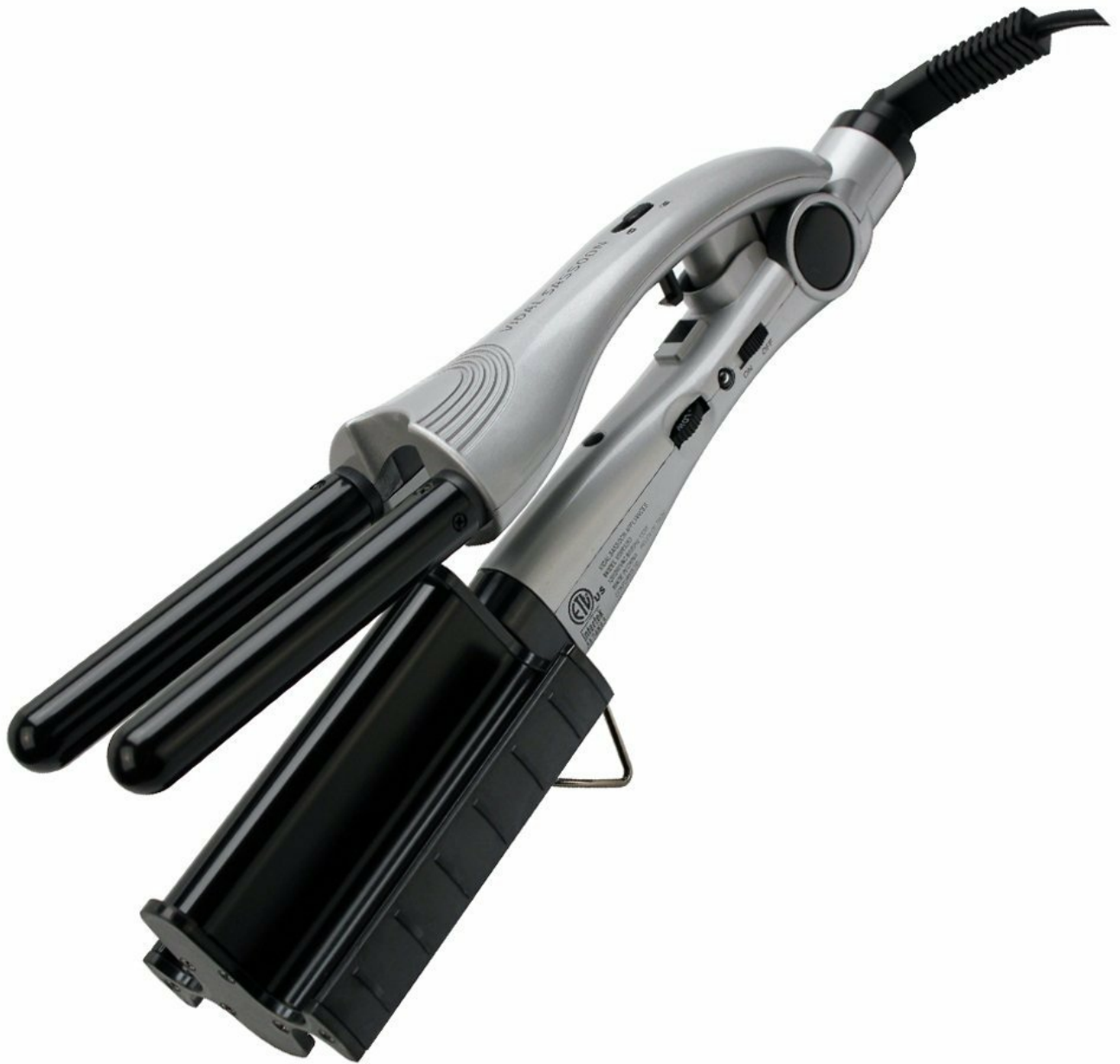
Image: The Vidal Sassoon 3-in-1 Tourmaline Waver Styling Iron with its standard barrel configuration.