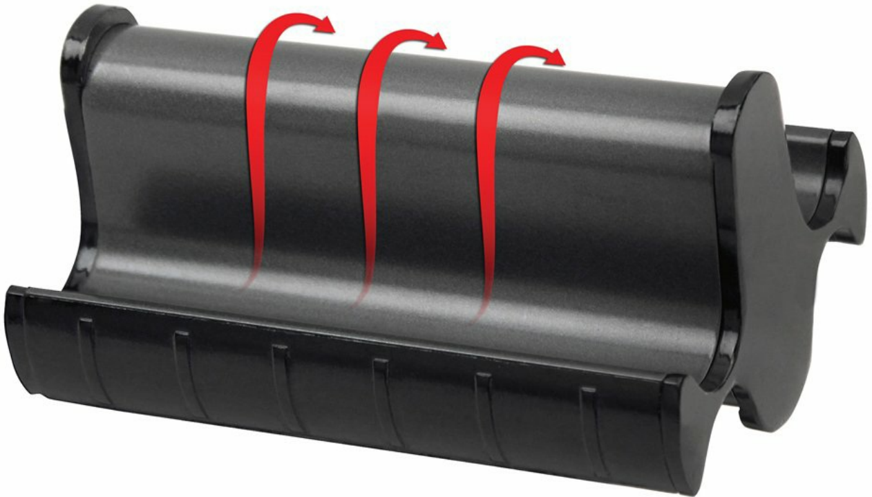
Image: Another interchangeable barrel, designed to create softer, more natural-looking waves.