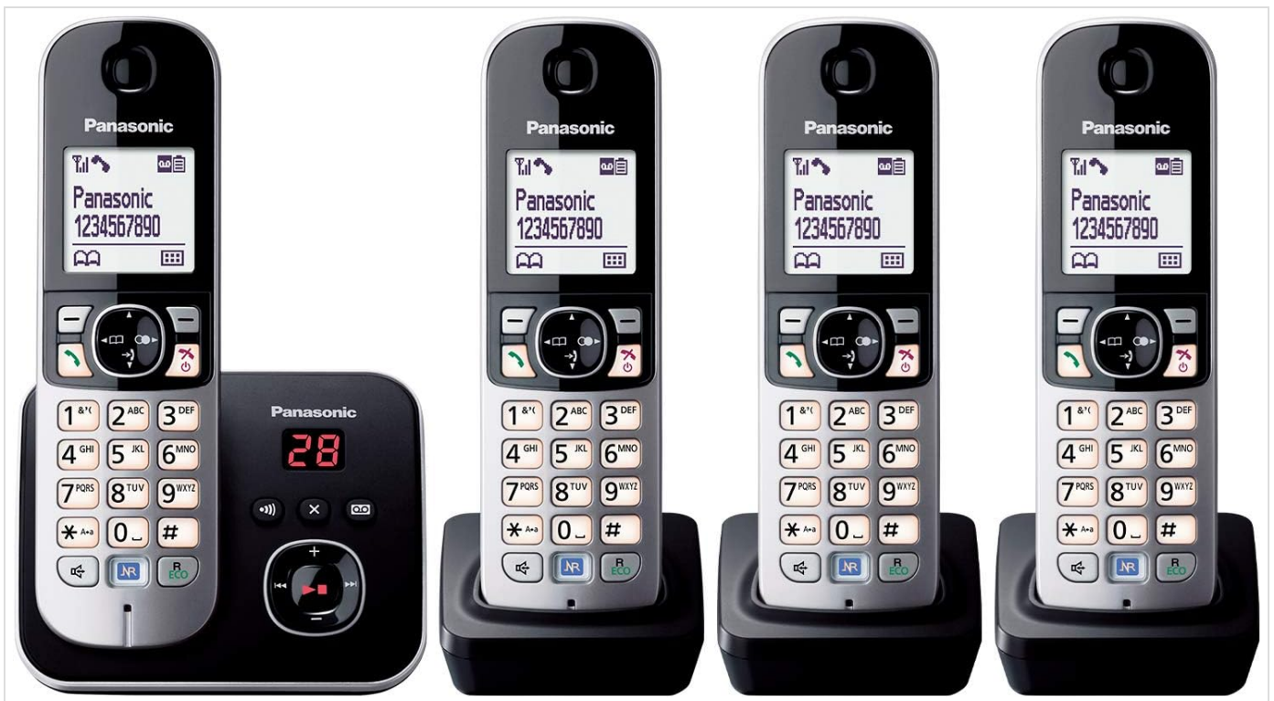
Image: The Panasonic KX-TG6824 cordless telephone system, showing the main base unit with one handset and three additional satellite handsets with their charging cradles. This setup allows for multiple phones throughout a home or office.

The Panasonic KX-TG6824 is a DECT cordless telephone system designed for home or office use, featuring an integrated answering machine and multiple handsets for extended coverage. This manual provides essential information for setting up, operating, and maintaining your telephone system.