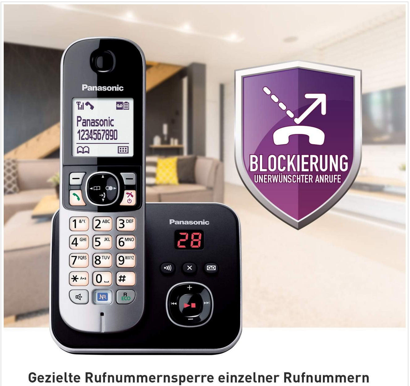
Image: The Panasonic phone handset and base unit are shown alongside a graphic shield icon indicating "BLOCKIERUNG UNERWÜNSCHTER ANRUF" (Blocking Unwanted Calls). This feature allows for targeted blocking of individual phone numbers.