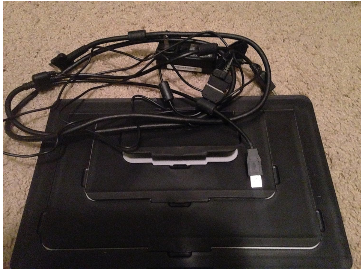
Image: The 3-in-1 cable connected to the back of the Wacom Cintiq 13HD.