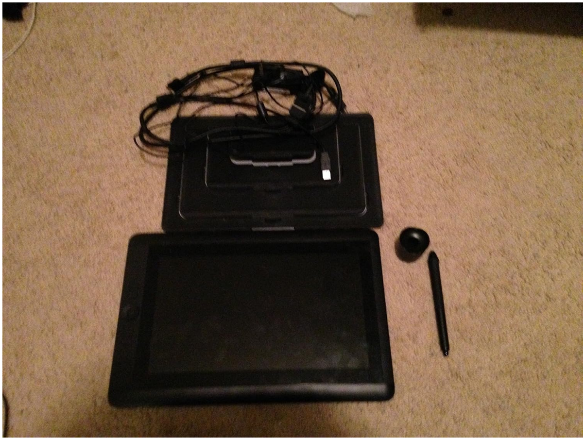
Image: Overview of the Wacom Cintiq 13HD, Pro Pen, and connecting cables.