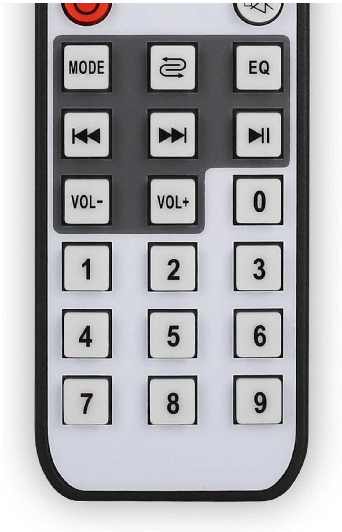
Figure 4.5: The included remote control, featuring power, mode, EQ, playback, volume, mute, and number buttons.