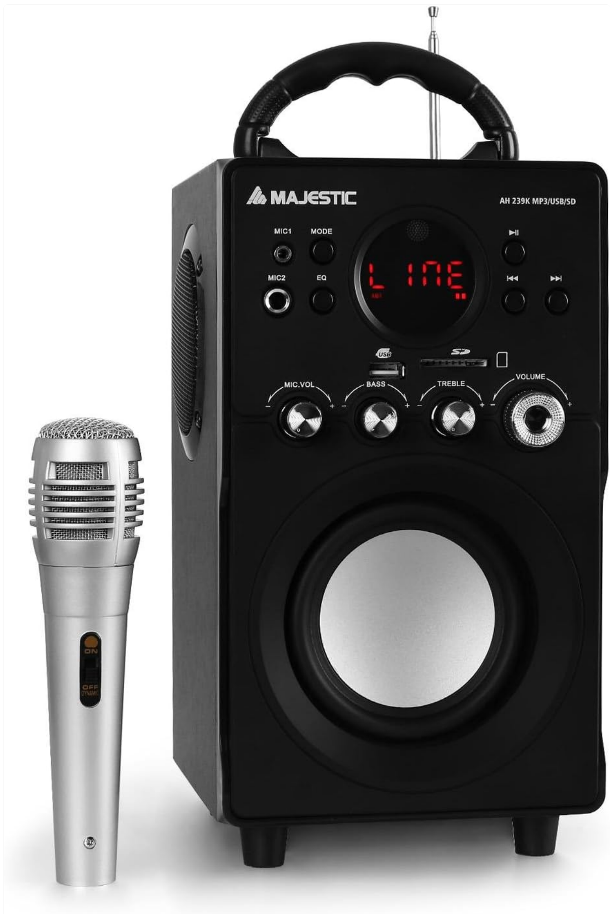
Figure 4.1: Front view of the Majestic AH239K Micro Hi-Fi System, showing the main speaker, LED display, control knobs, and microphone inputs. The included microphone is positioned next to the unit.