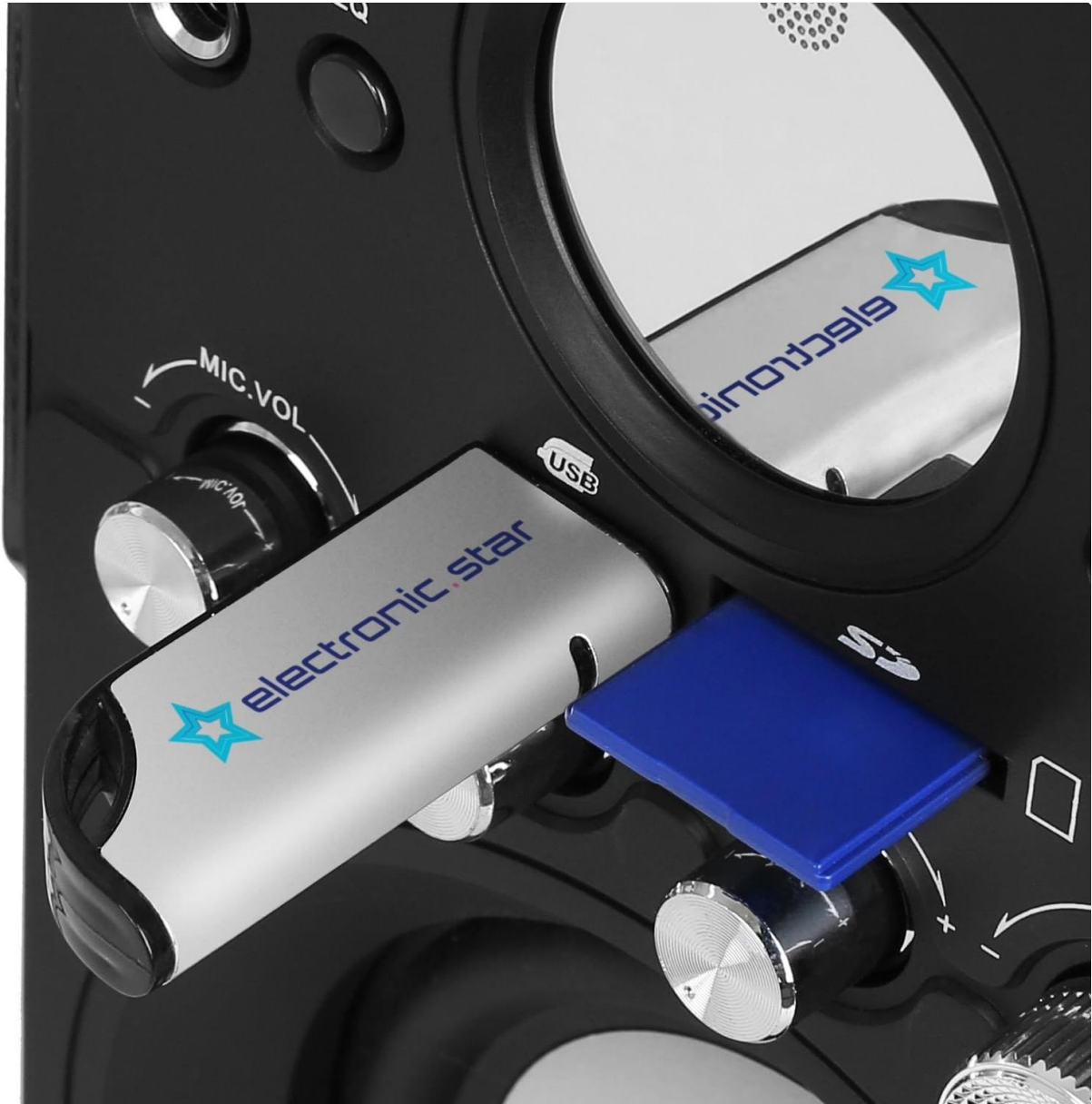
Figure 4.4: Close-up view of the USB port and SD card slot, located on the front panel for easy access.