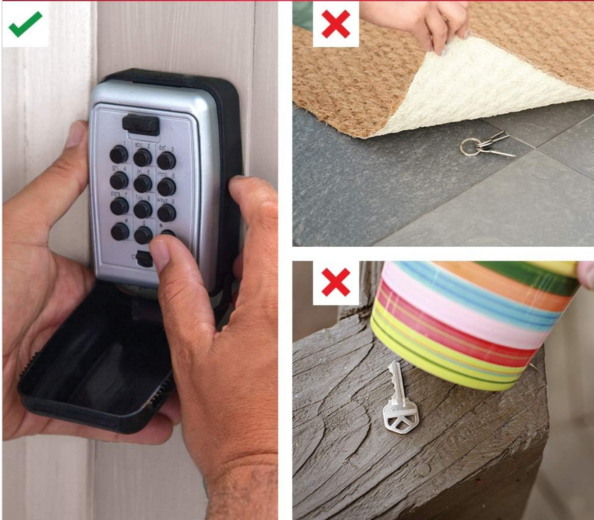
Image: A comparison showing the secure method of storing keys in the Master Lock 5423D versus insecure methods like under a doormat or in a plant pot.