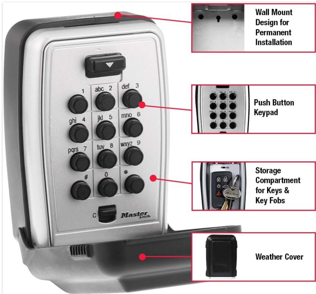
Image: A detailed view of the Master Lock 5423D, highlighting its wall mount design, push-button keypad, storage compartment for keys, and protective weather cover.