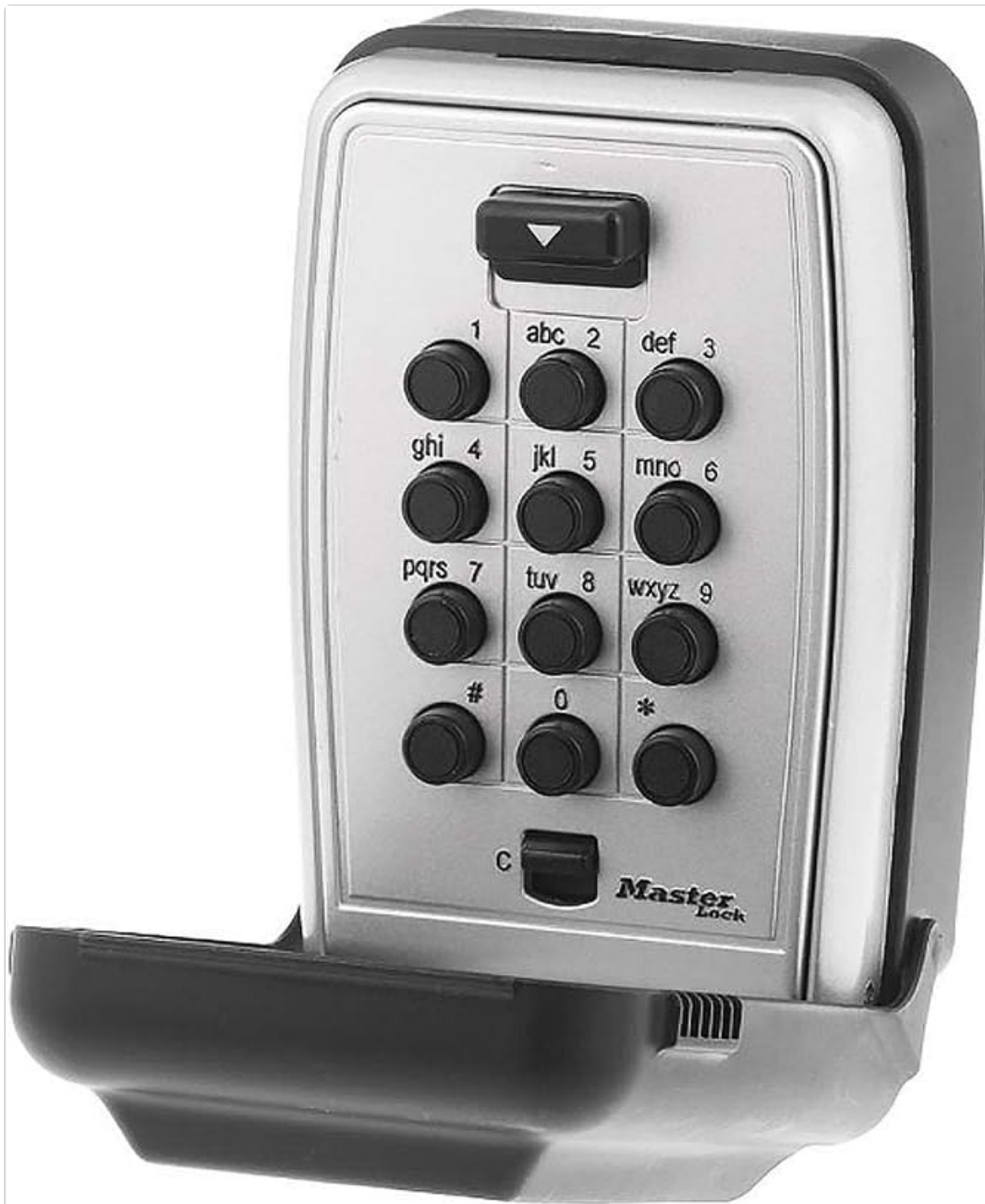
Image: The Master Lock 5423D Wall Mount Push Button Key Lock Box, featuring a silver keypad with black buttons and a black weather-resistant housing.