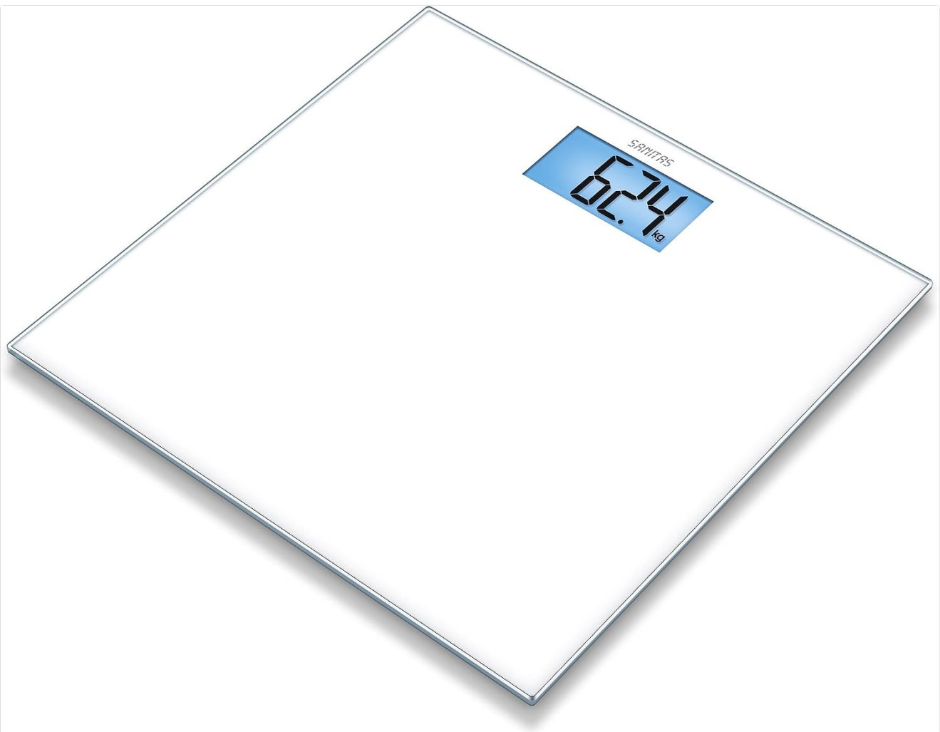
Image 1.1: Sanitas SGS03 Pure White Glass Bathroom Scale showing a weight reading.