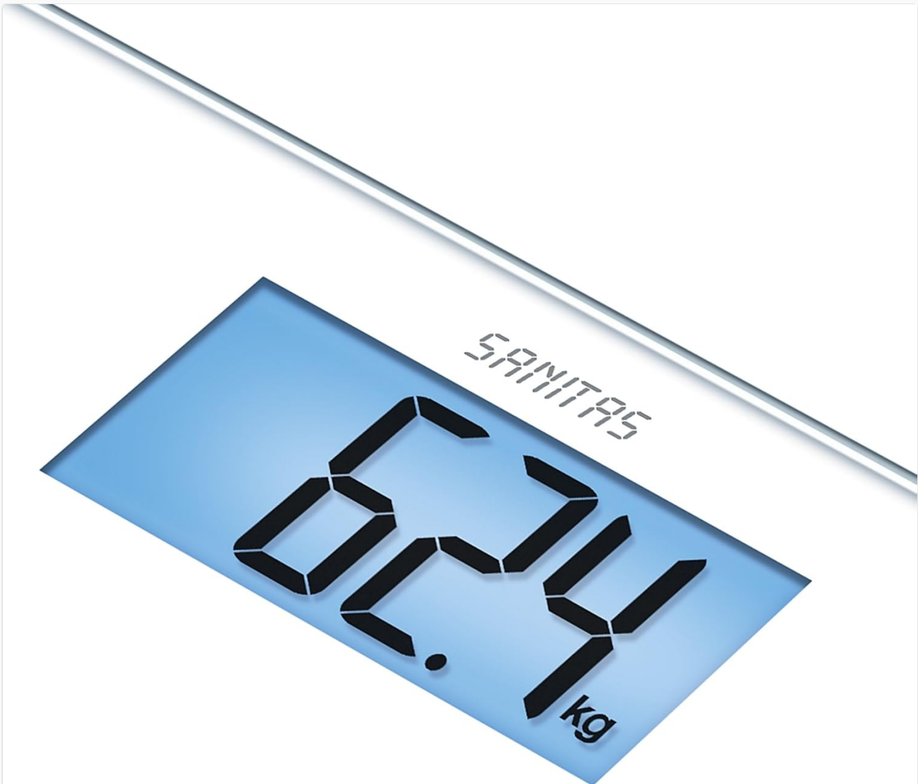
Image 3.1: Close-up view of the digital LCD display showing a weight in kilograms.