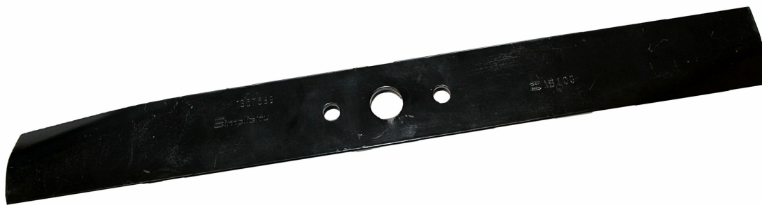
Figure 1: Genuine Simplicity Replacement Blade (Part # 1657589ASM). This image shows the black metal blade with a central circular hole and two smaller circular holes on either side, designed for mounting on lawn mower decks.