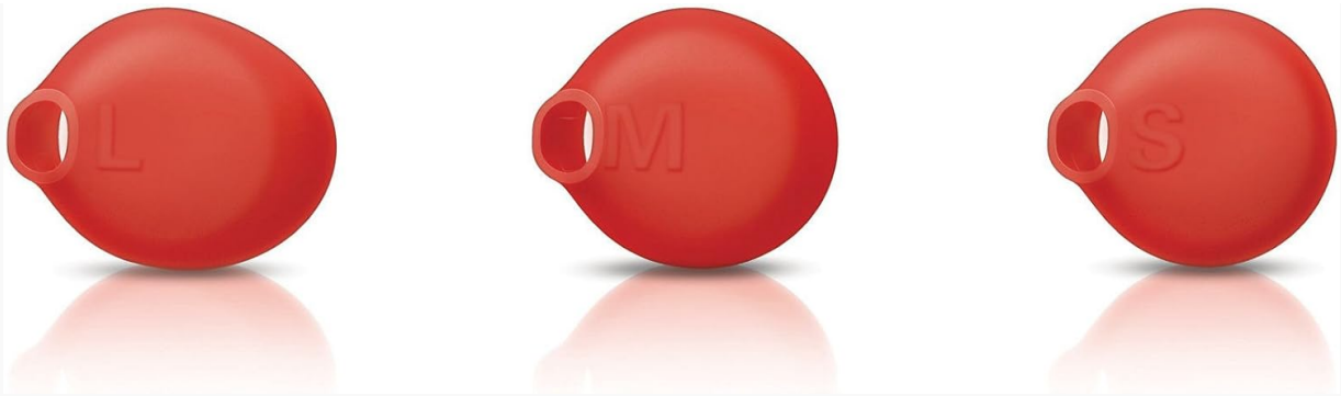
Image: Included ear caps in small, medium, and large sizes to ensure an optimal fit for different ear canal sizes.