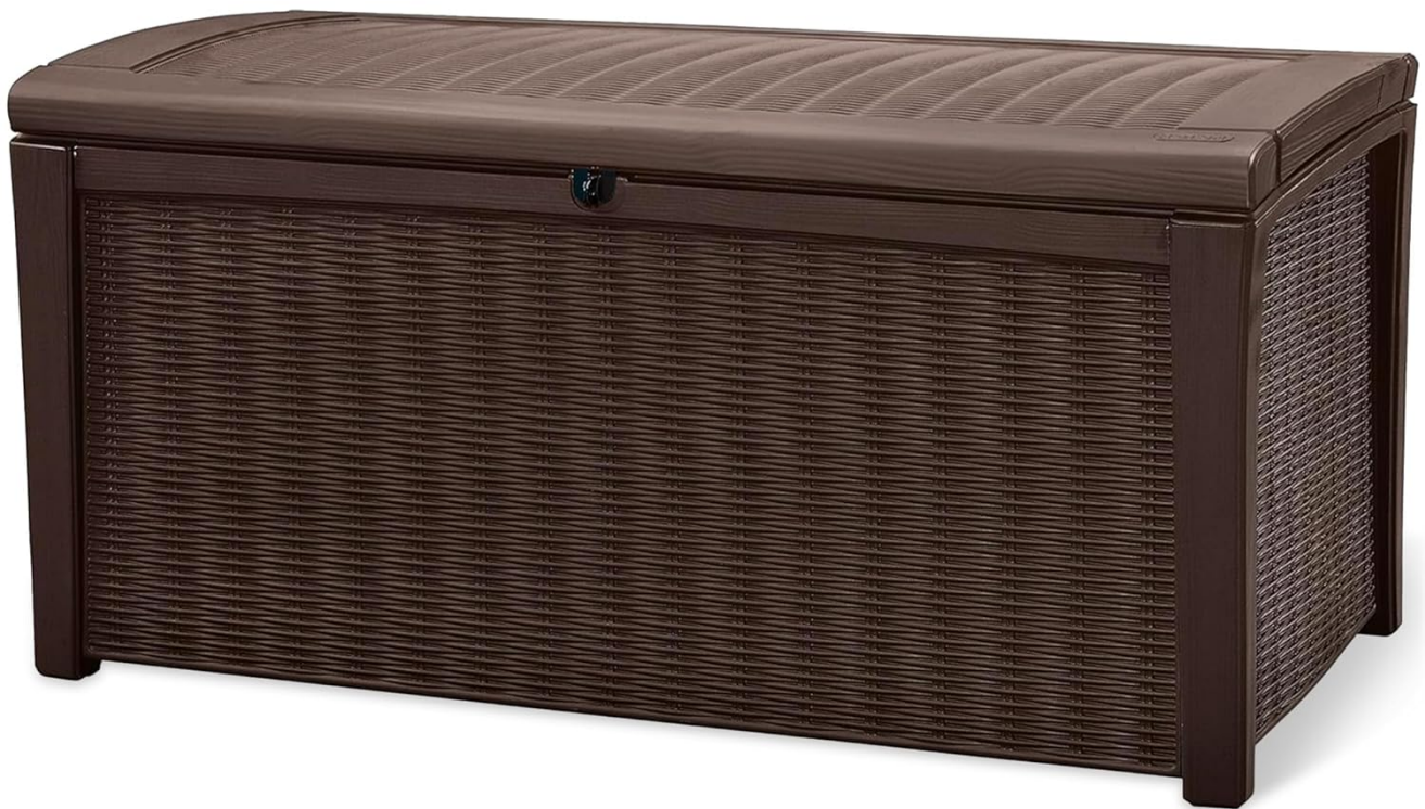
Figure 1: Keter Borneo 110 Gallon Outdoor Storage Deck Box (Brown Wicker)