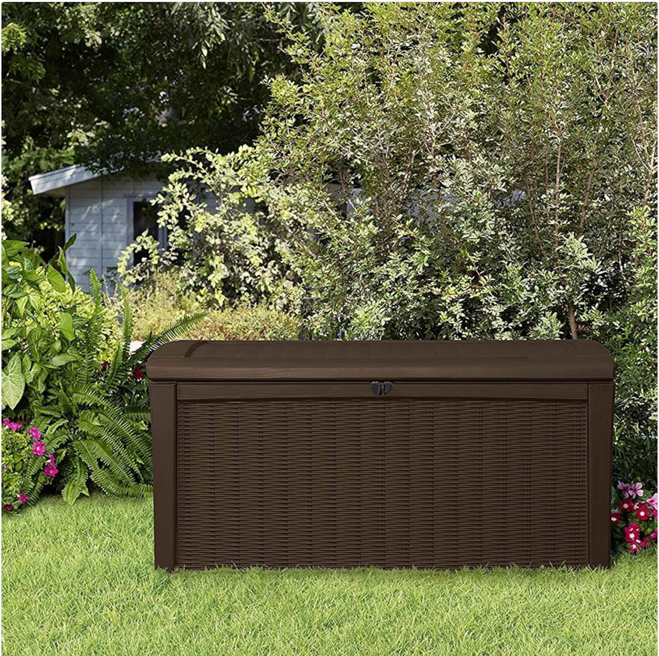
Figure 4: The durable, weather-resistant polypropylene construction prevents rusting, peeling, and denting.