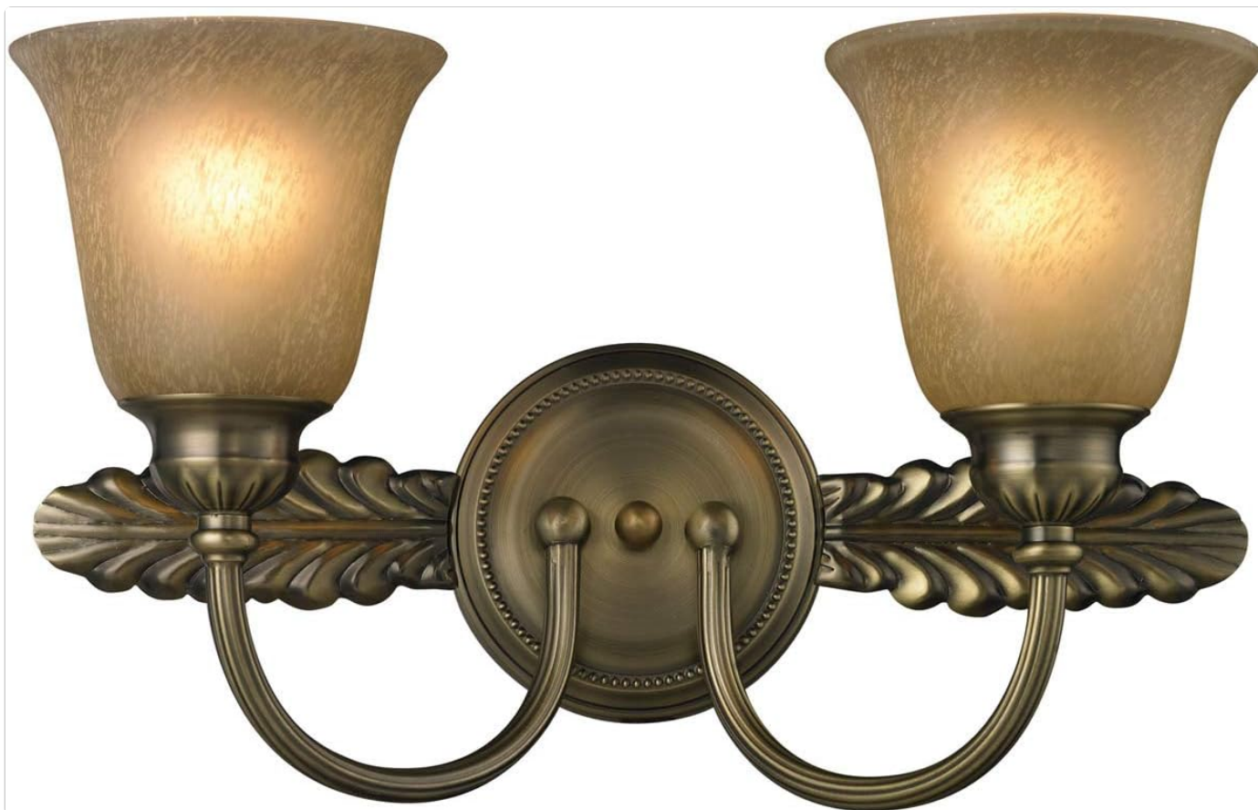
Figure 3.1: Elk Lighting Ventura 2-Light Bathbar. This image displays the complete bathbar fixture, showcasing its antique brass finish, decorative base, and two caramel amber glass shades.