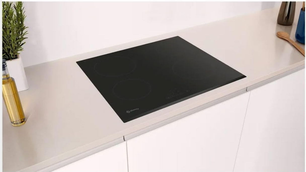
Image Description: A wide shot of the black Balay ceramic hob seamlessly integrated into a light-colored kitchen countertop. The hob is clean and reflects the surrounding kitchen environment, showcasing its sleek design when installed.