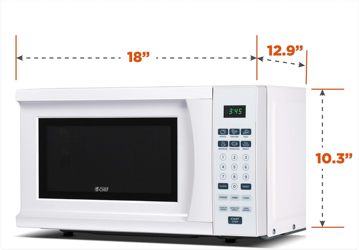
Image: The Commercial CHEF CHM770W microwave oven with its key dimensions (width, height, depth) clearly indicated.