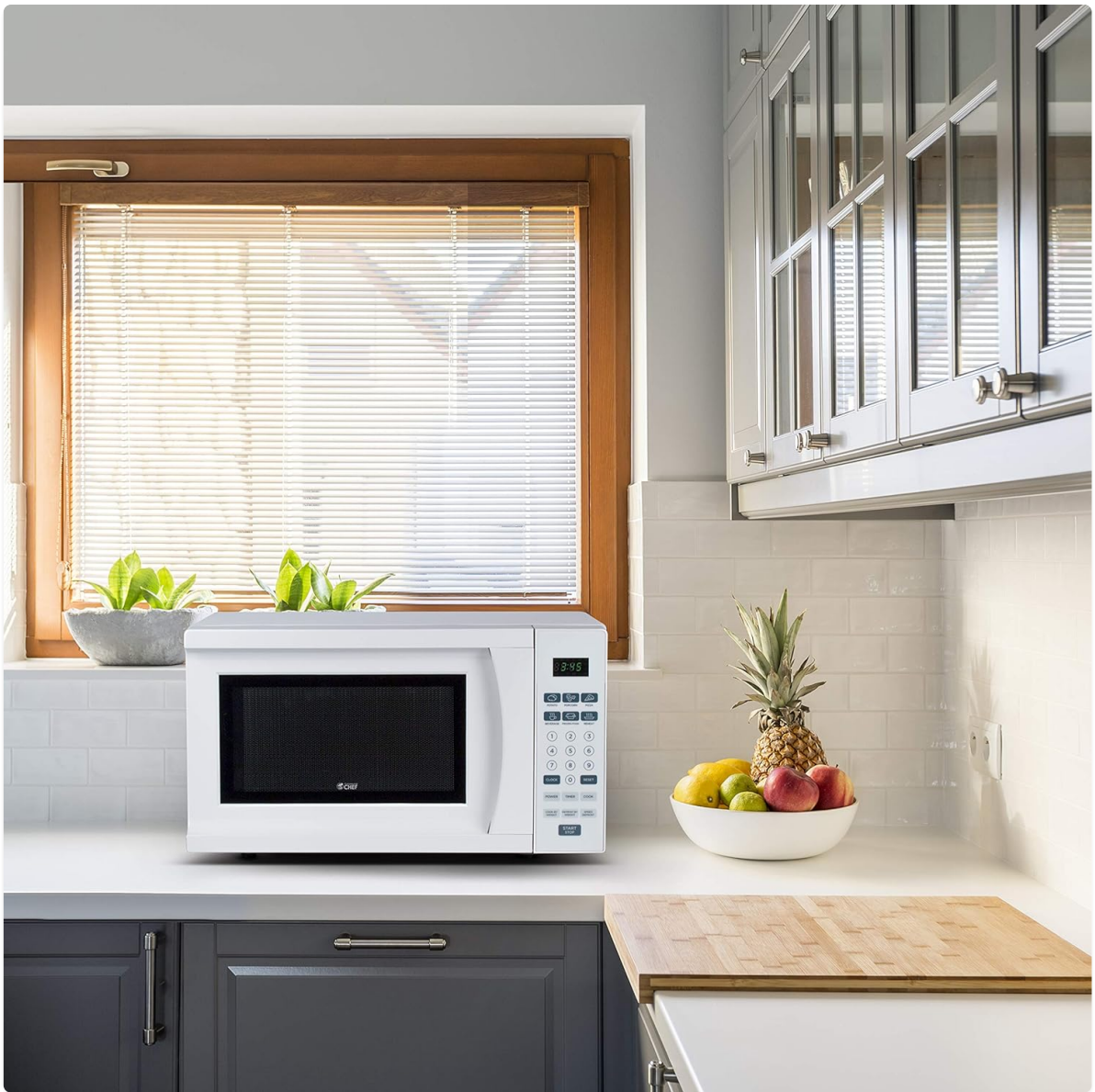
Image: The white Commercial CHEF CHM770W microwave oven positioned on a kitchen countertop, illustrating its compact design suitable for limited spaces.