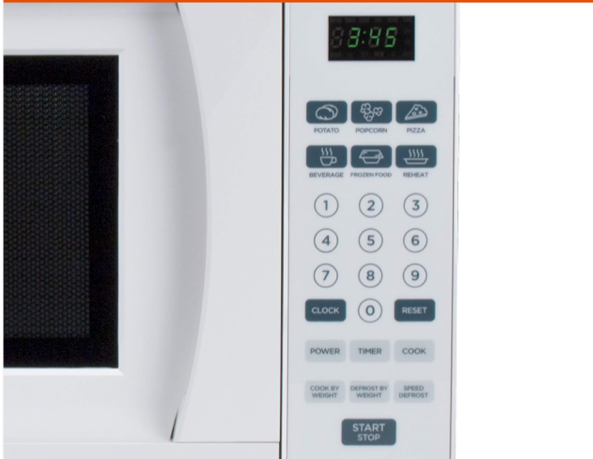
Image: A detailed view of the microwave's control panel, showing the digital clock, quick-cook buttons, power level, timer, cook, and defrost options.