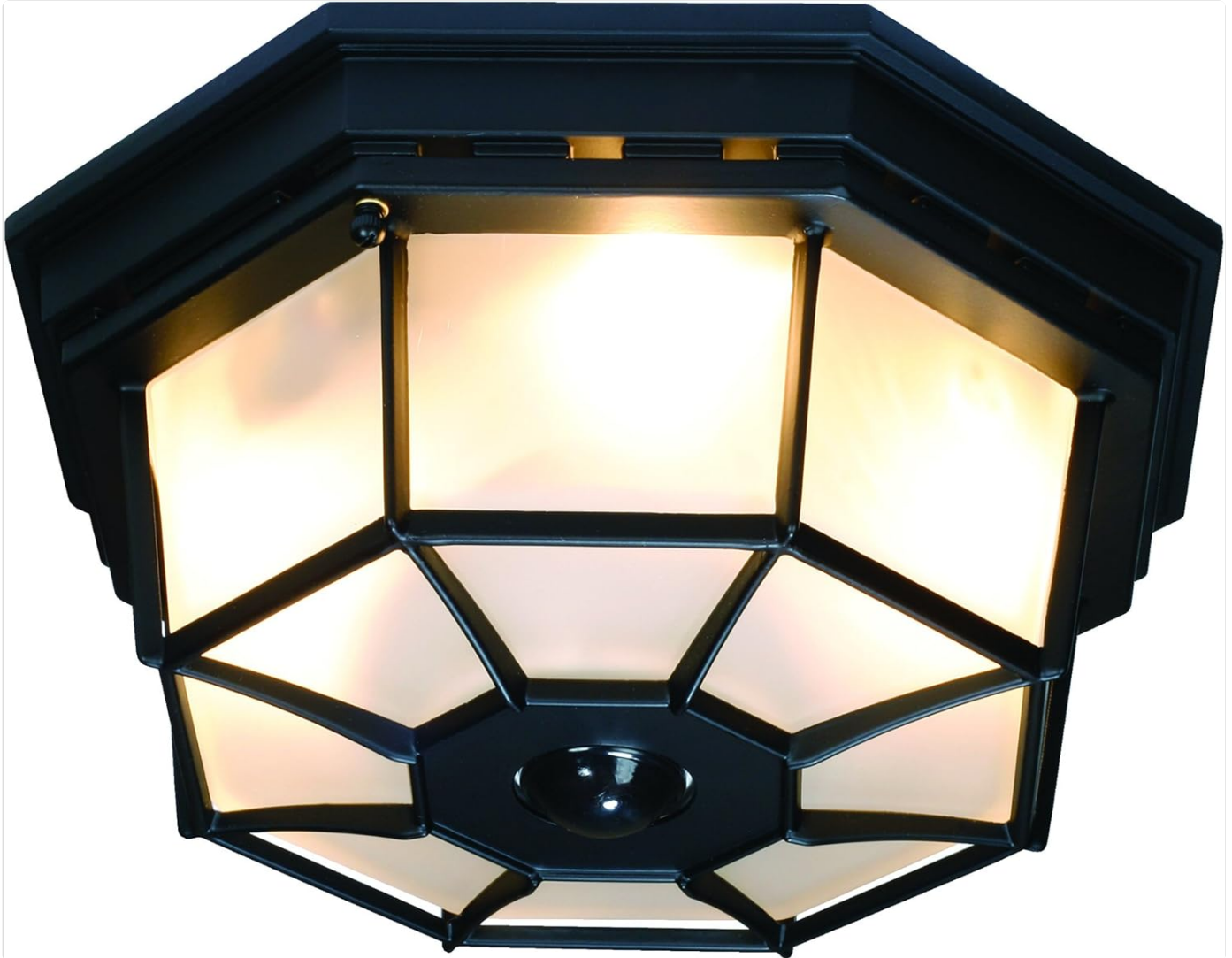
Figure 2: The Heath Zenith HZ-4300-BK-B light fixture illuminated, demonstrating its light output.