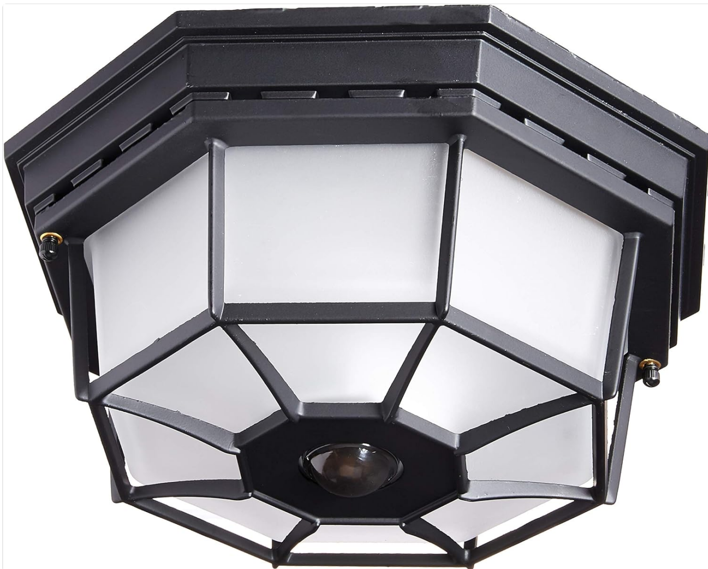
Figure 1: Front view of the Heath Zenith HZ-4300-BK-B Ceiling Motion Light, showcasing its octagonal design and frosted glass panels.