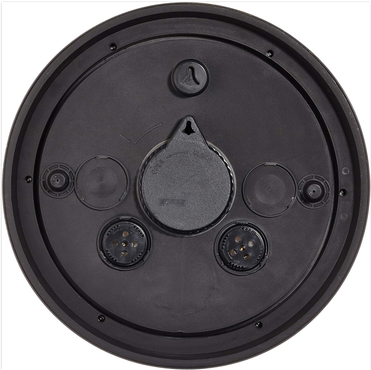
Image: Rear view of the clock, highlighting the central battery compartment and the triangular mounting hook.