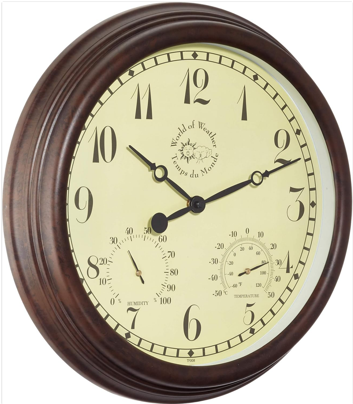
Image: Angled view of the Esschert Design Large Plastic Outdoor Clock and Thermometer, showcasing its depth and design.