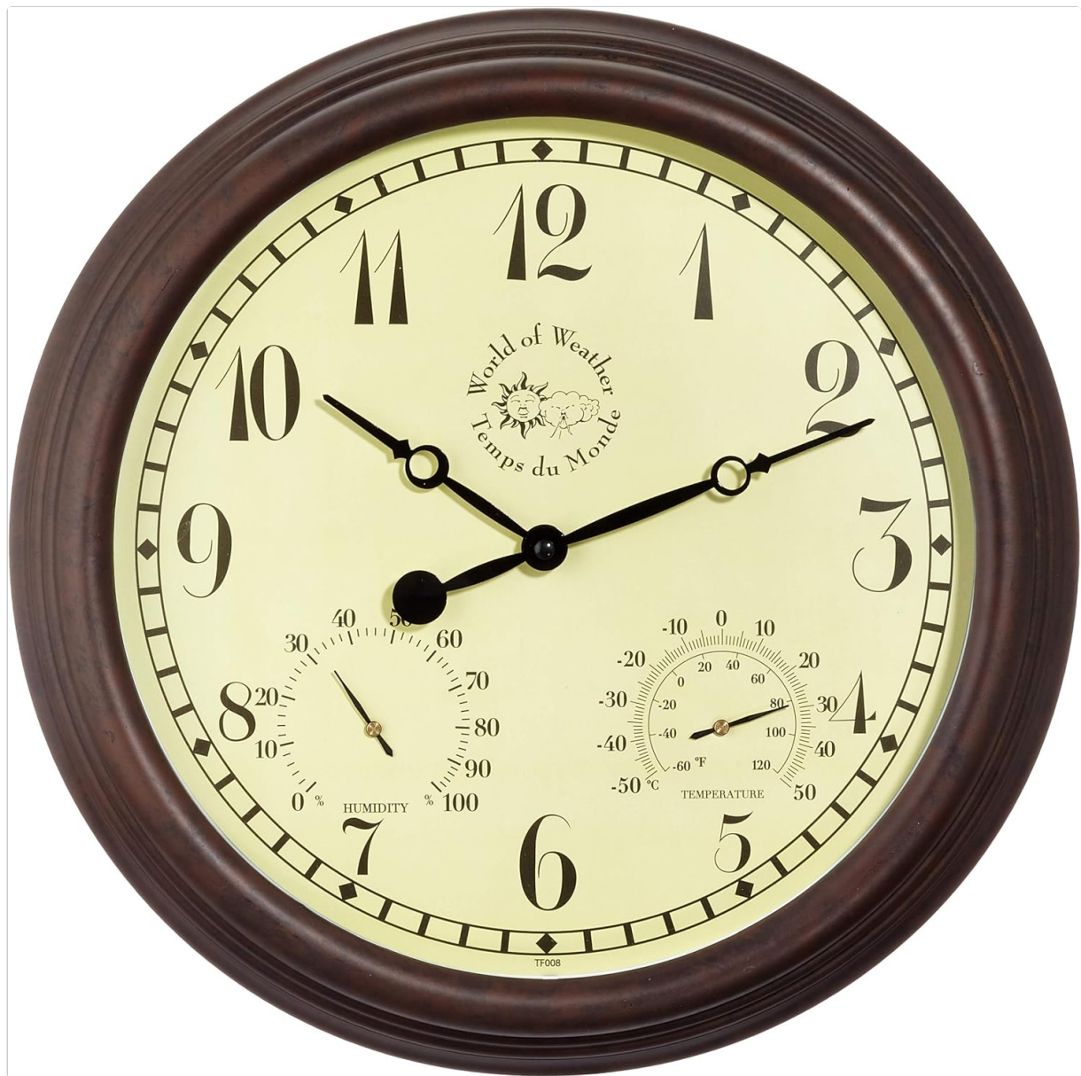
Image: Front view of the Esschert Design Large Plastic Outdoor Clock and Thermometer, displaying time, temperature, and humidity dials.