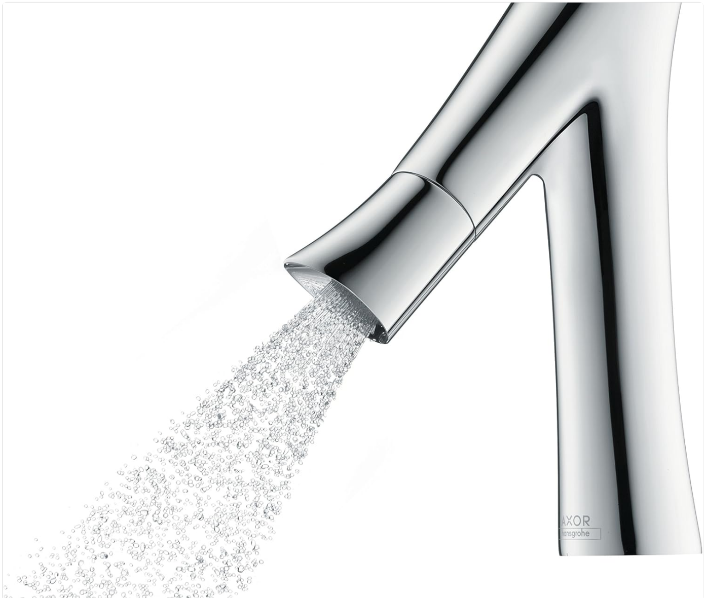
Figure 3.1: The Hansgrohe Axor Starck Organic 12014000 faucet in operation, demonstrating the smooth water flow from its spout.