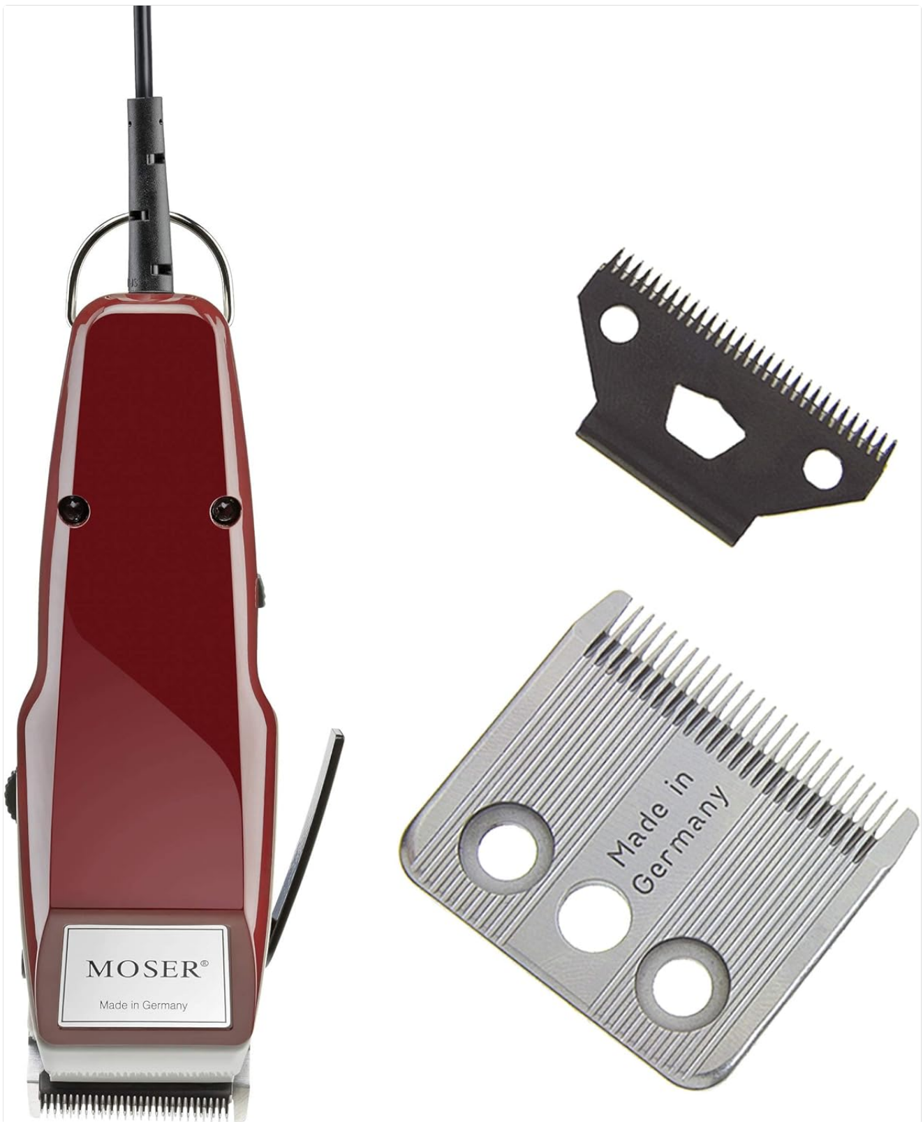
Image: Close-up image of the MOSER 1400 PLUS Professional Hair Clipper's blade assembly, showing the removable cutting blade and the fixed blade.