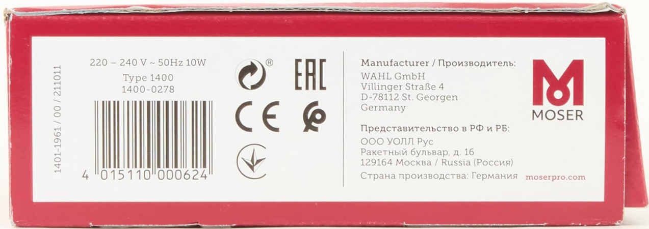
Image: Bottom view of the MOSER 1400 PLUS Professional Hair Clipper packaging, displaying manufacturer details, electrical specifications, and the product barcode (UPC).