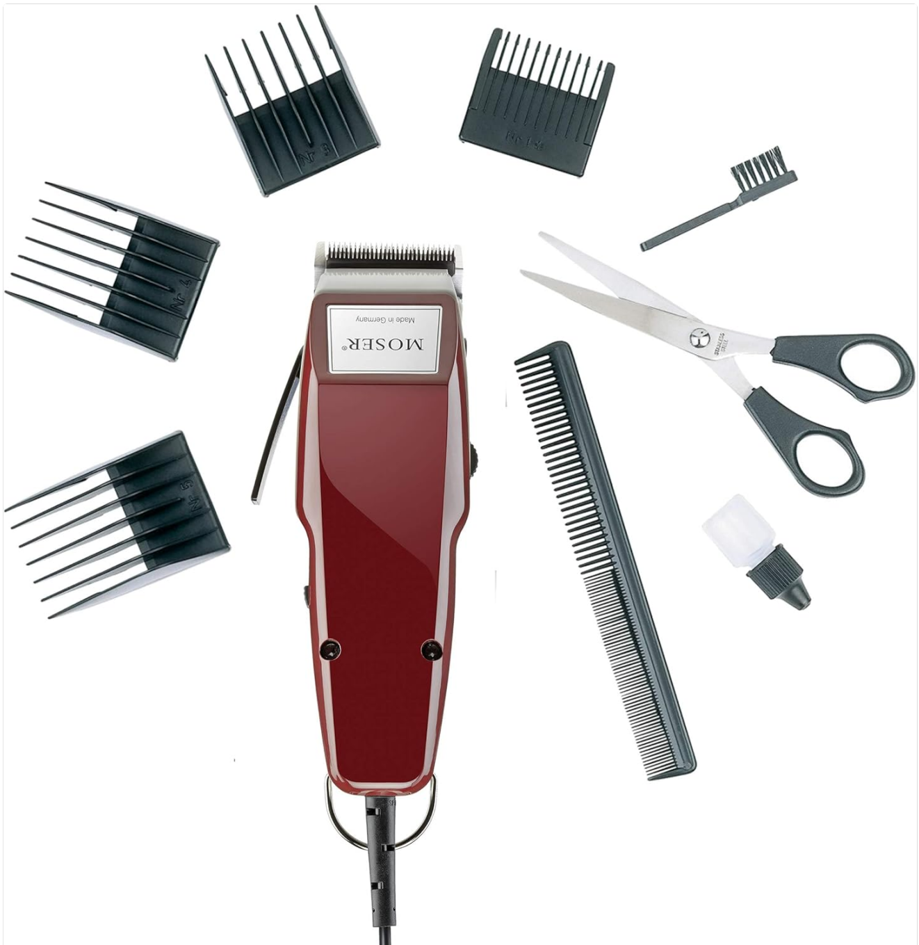
Image: The MOSER 1400 PLUS Professional Hair Clipper along with its included accessories: multiple attachment combs, a cleaning brush, a pair of scissors, and a small bottle of blade oil.