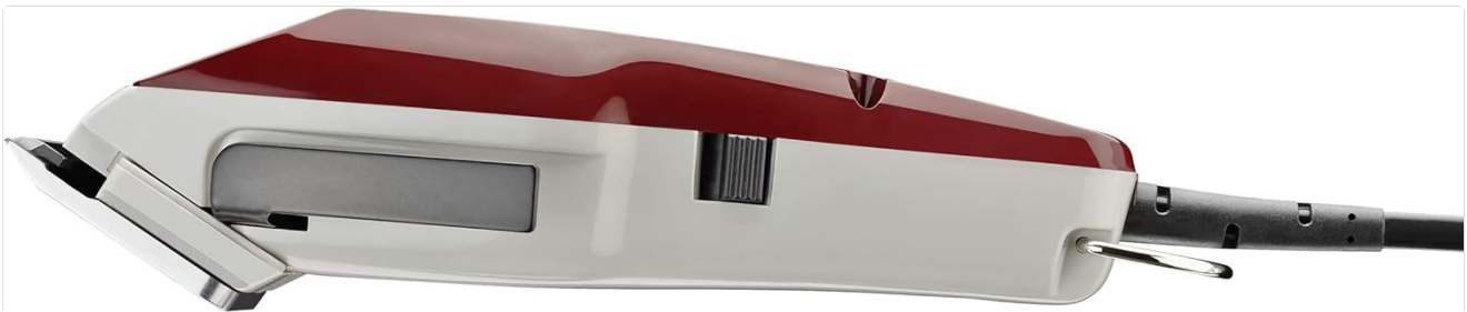
Image: Side view of the MOSER 1400 PLUS Professional Hair Clipper, highlighting the adjustable MultiClick cutting length lever.