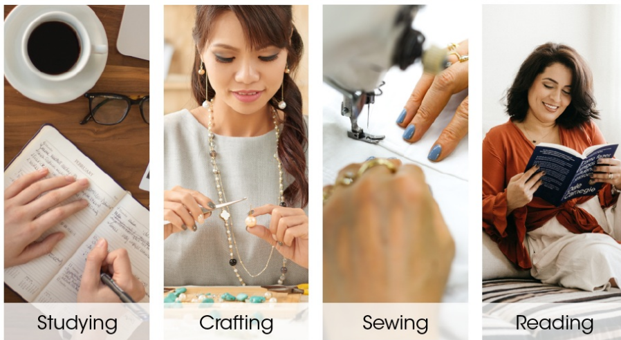
Figure 1: The OttLite lamp is perfect for various tasks including studying, crafting, sewing, and reading, providing optimal illumination.