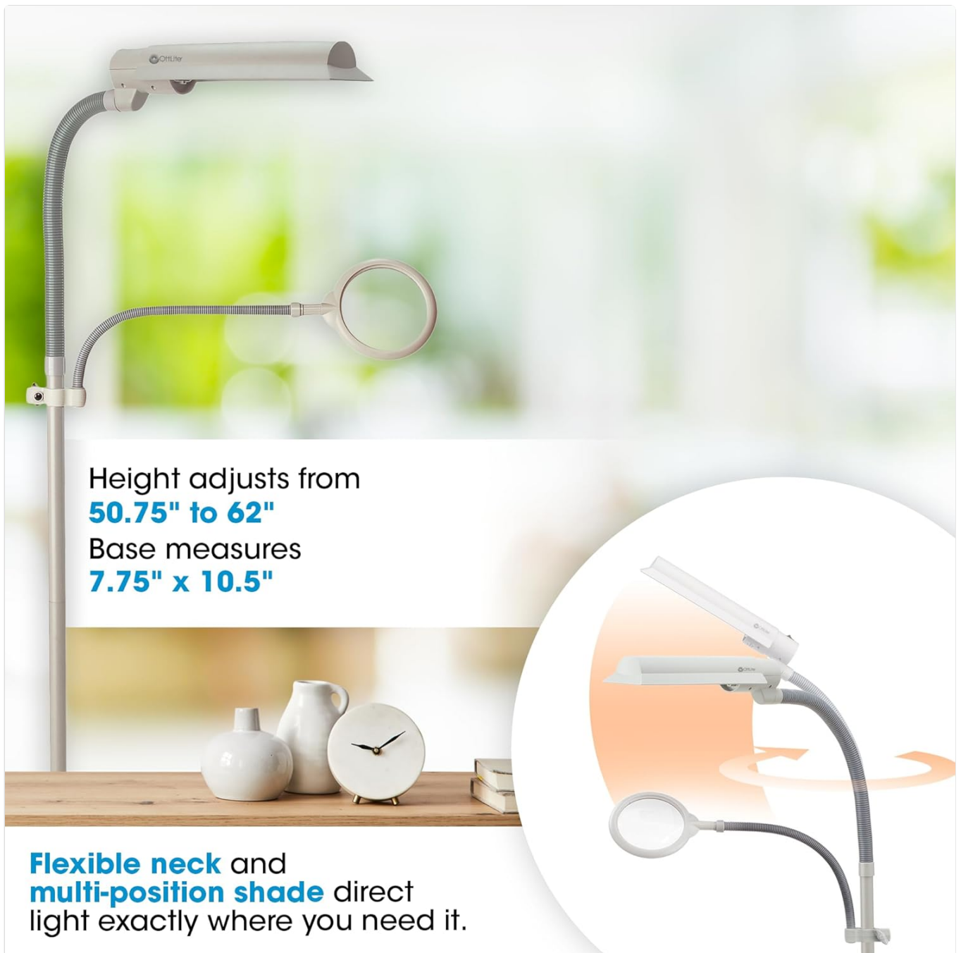
Figure 5: The lamp's flexible neck and adjustable height feature, allowing precise positioning of light and magnification.