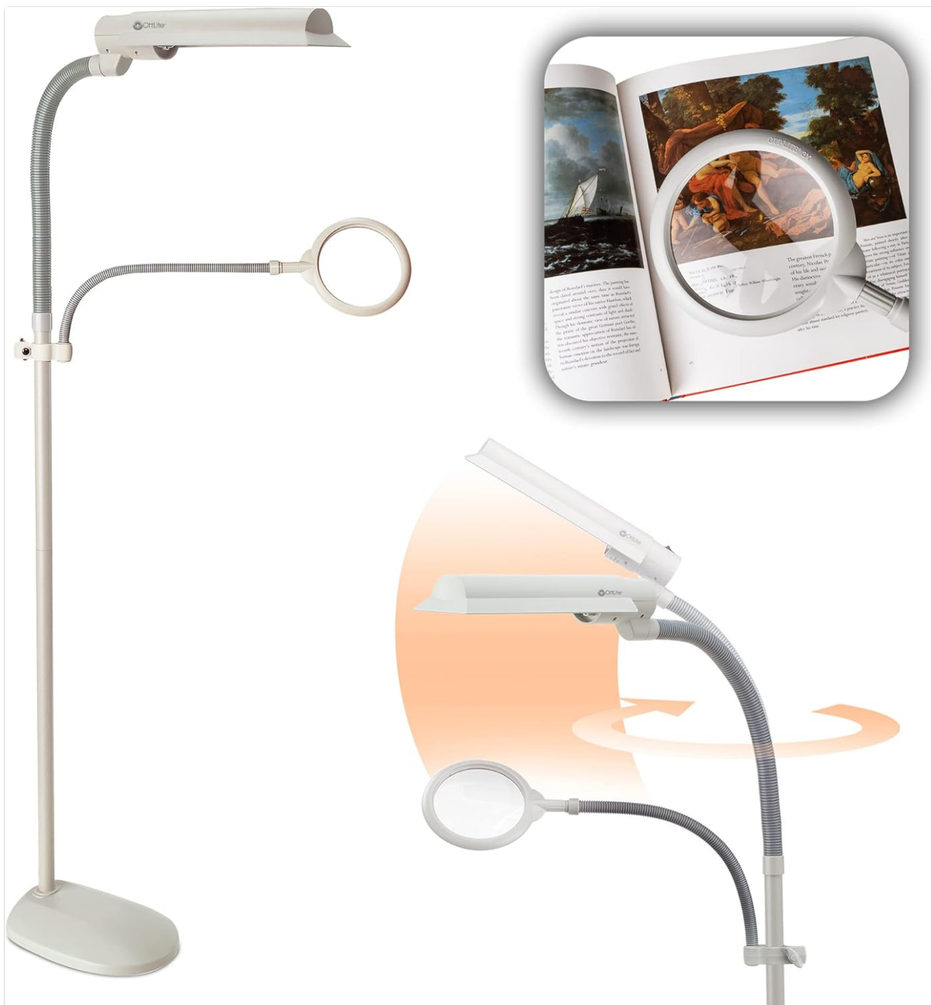
Figure 2: Fully assembled OttLite Easy View Floor Lamp, showing the main lamp head and the flexible magnifier arm.