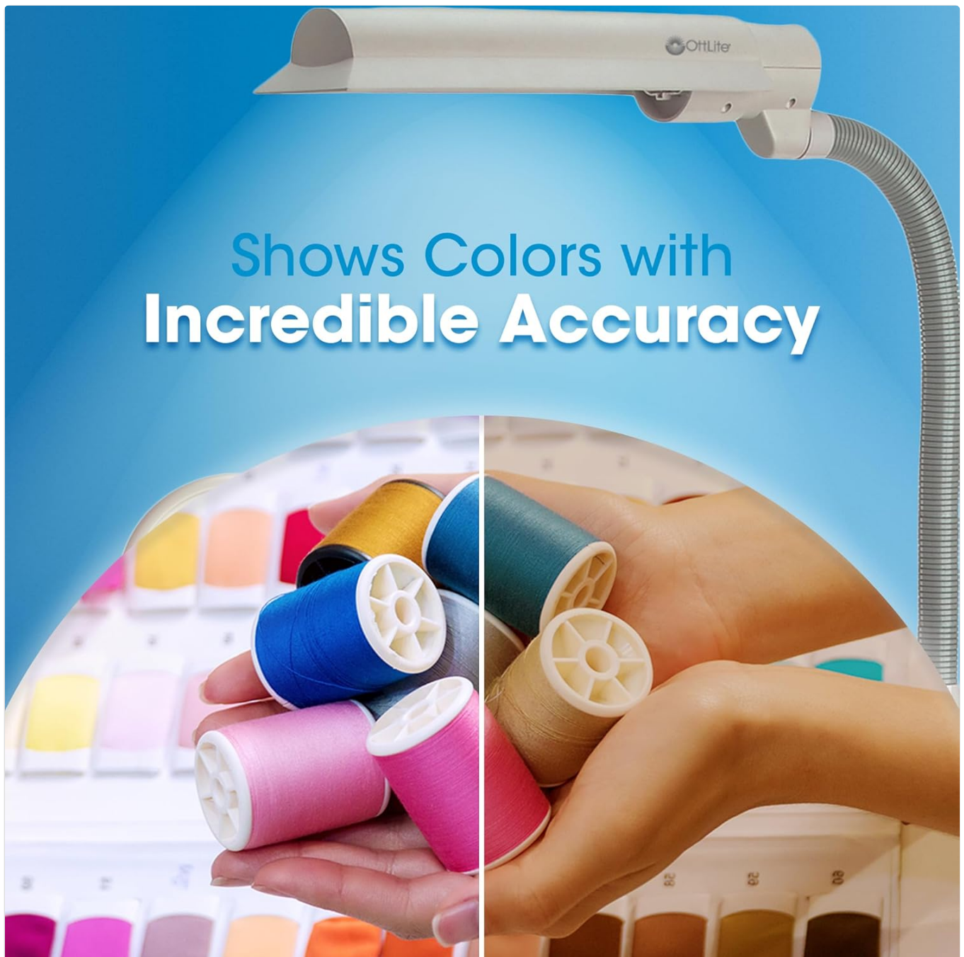
Figure 7: The lamp's ability to show colors with incredible accuracy, beneficial for crafts and tasks requiring true color perception.