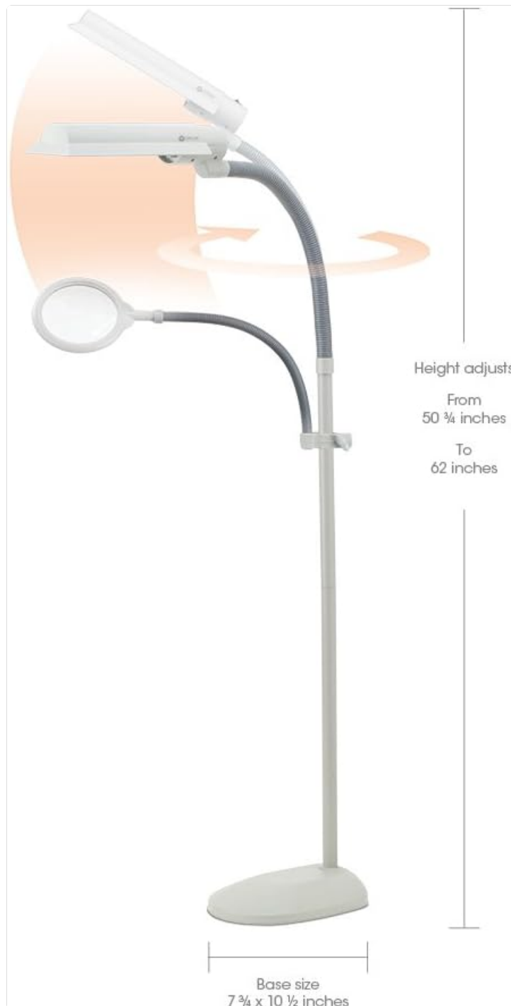
Figure 4: Illustration of the lamp's adjustable height (50.75 to 62 inches) and base dimensions (7.75 x 10.5 inches).