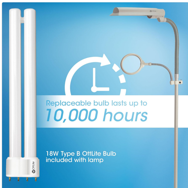
Figure 8: The included 18W Type B OttLite Bulb, designed for long-lasting performance up to 10,000 hours.