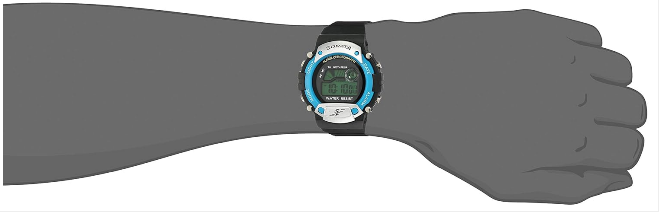
Figure 3: Watch size guide for men's and unisex watches.