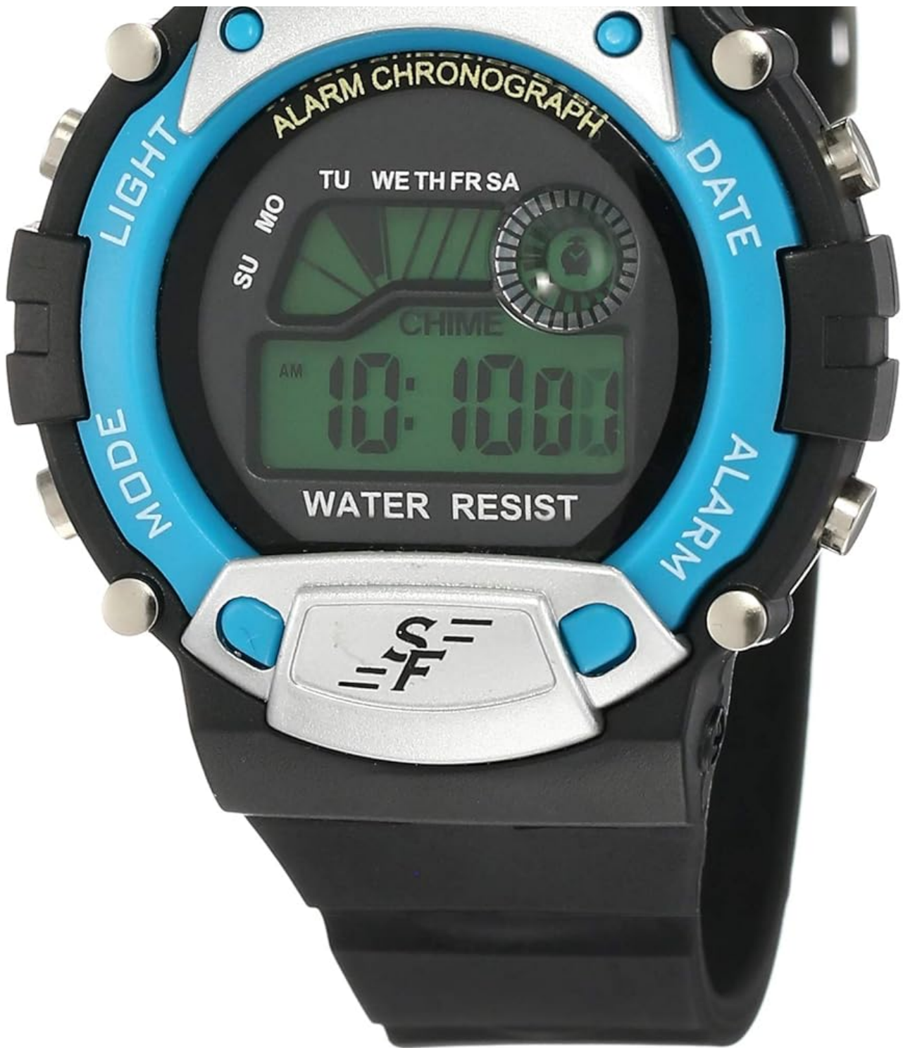
Figure 1: Front view of the SF Venus Digital Watch, highlighting the digital display and control buttons.