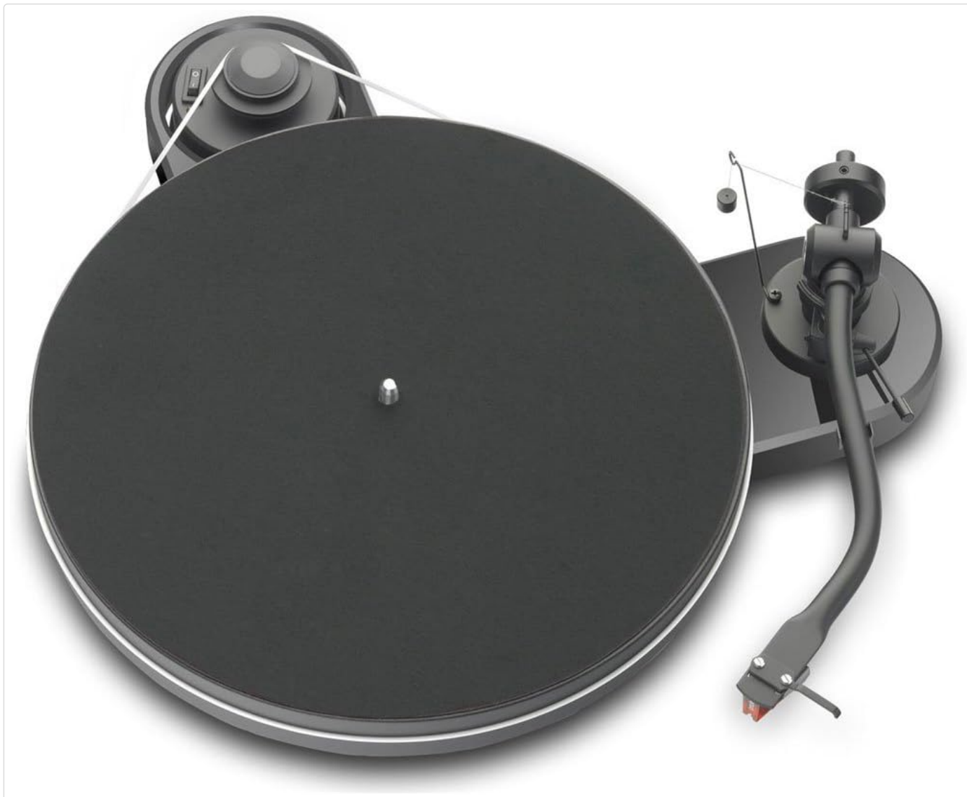
Figure 1: Top view of the Pro-Ject RM 1.3 Turntable, illustrating the platter, outboard motor, and tonearm assembly. This image shows the general layout for component placement.