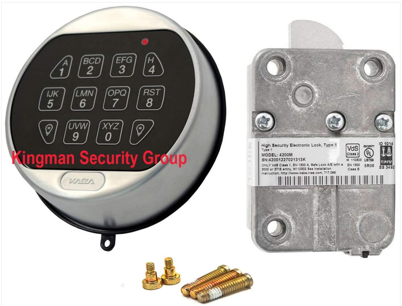
Image: The LA GARD II Basic Electronic Combination Lock, showing both the satin chrome keypad and the internal lock mechanism.