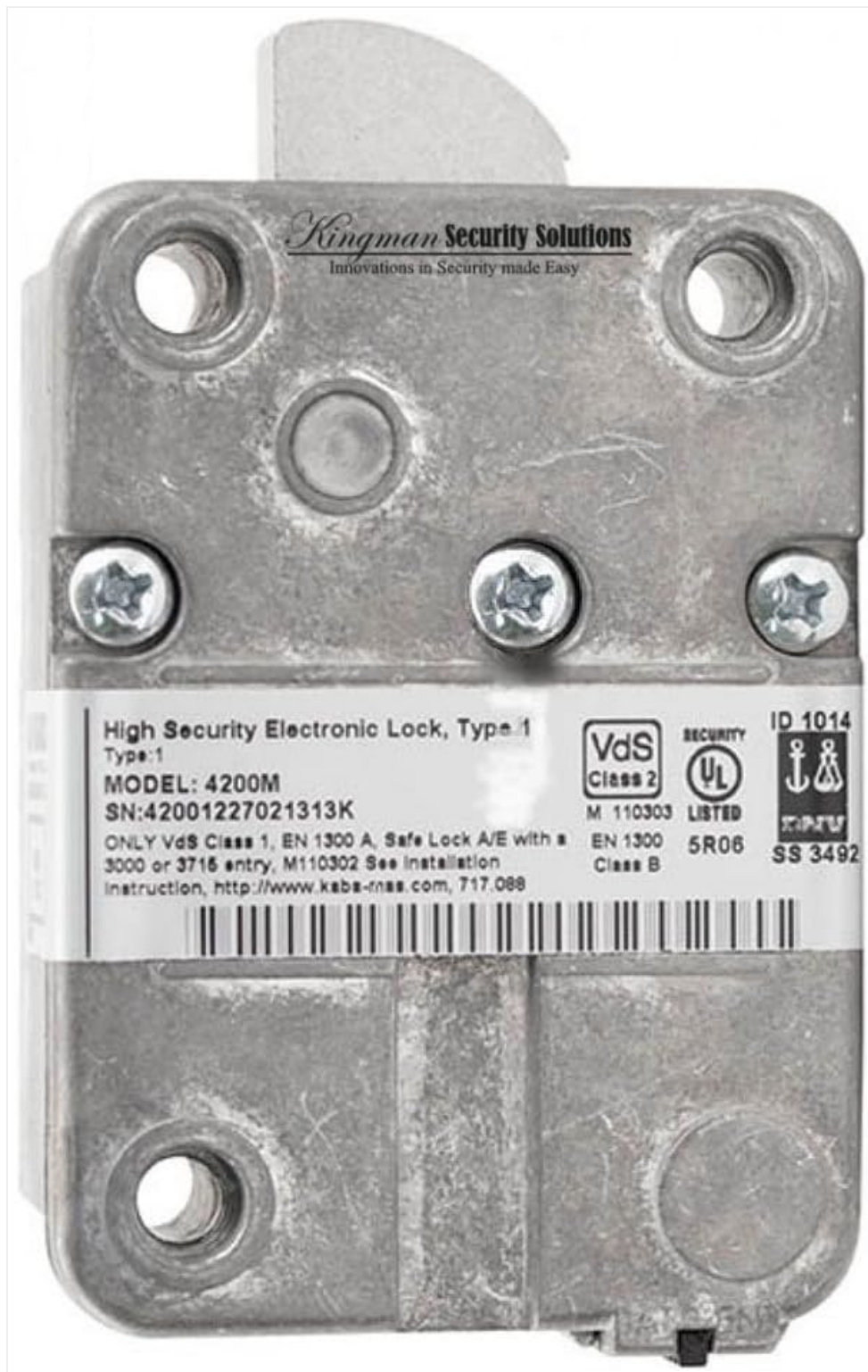
Image: Close-up view of the LA GARD II lock mechanism, showing mounting points and internal components.