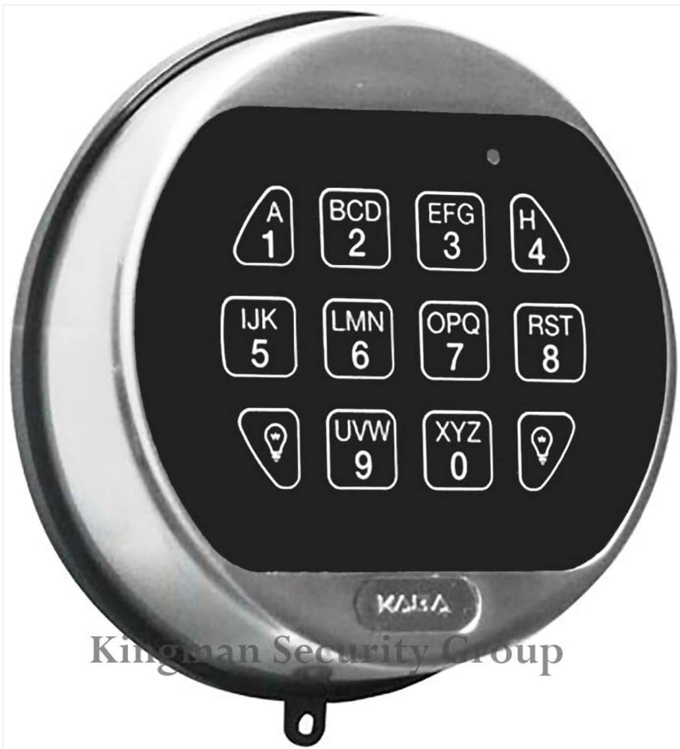
Image: Front view of the LA GARD II electronic keypad, showing the numerical and functional buttons.