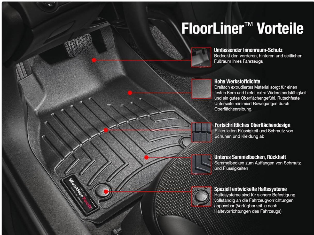
Image 4.1: Diagram highlighting the comprehensive interior protection, high-density material, advanced surface design, lower collection basin, and specially developed retention systems of the FloorLiner.