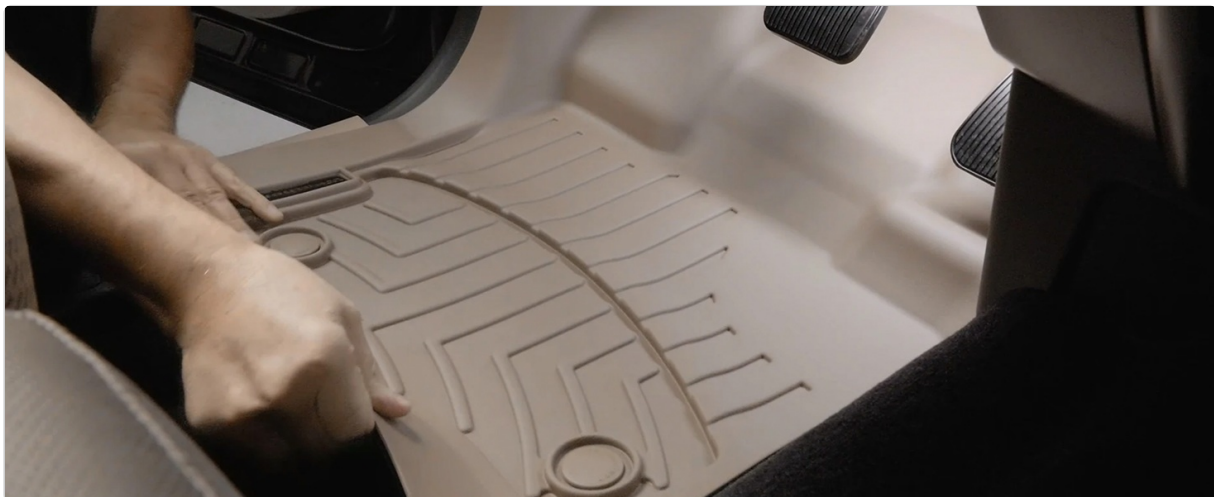
Image 4.2: An illustration demonstrating the extensive coverage provided by WeatherTech FloorLiners in a vehicle's footwell.