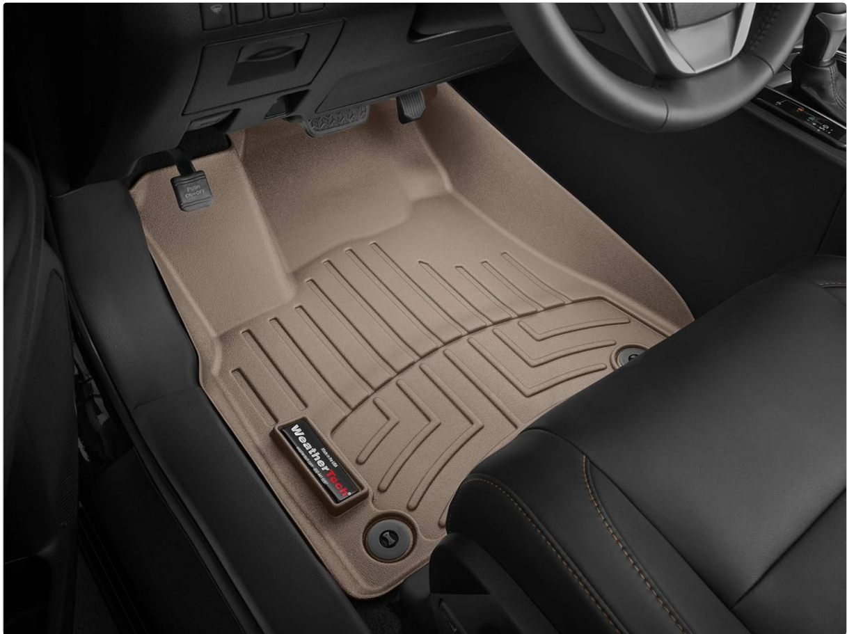
Image 1.2: A tan WeatherTech FloorLiner correctly installed in the driver's footwell of a vehicle, demonstrating its custom fit.