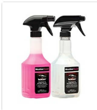
Image 5.3: WeatherTech's recommended cleaning and protection products for FloorLiners and floor mats.