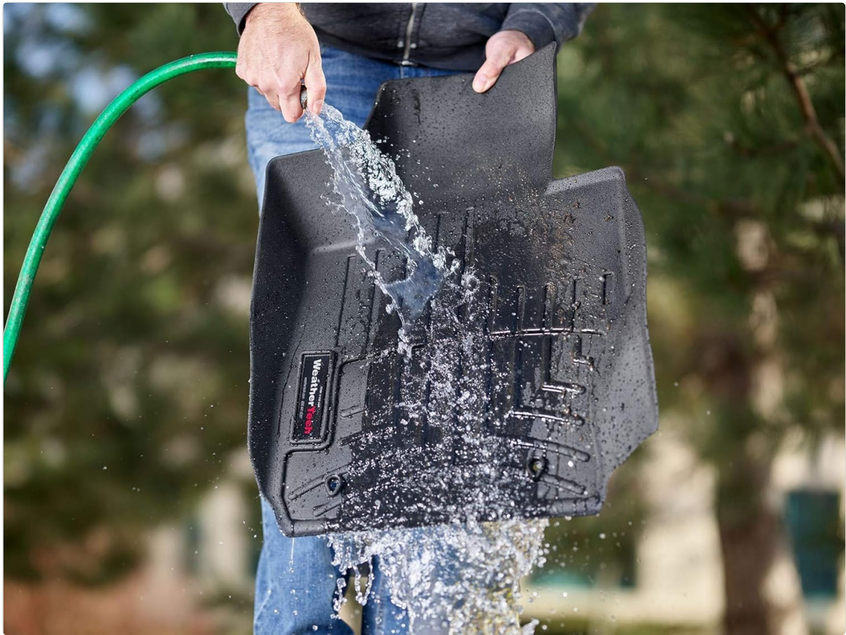
Image 5.2: A person cleaning a FloorLiner with a garden hose, illustrating the ease of rinsing off dirt and debris.