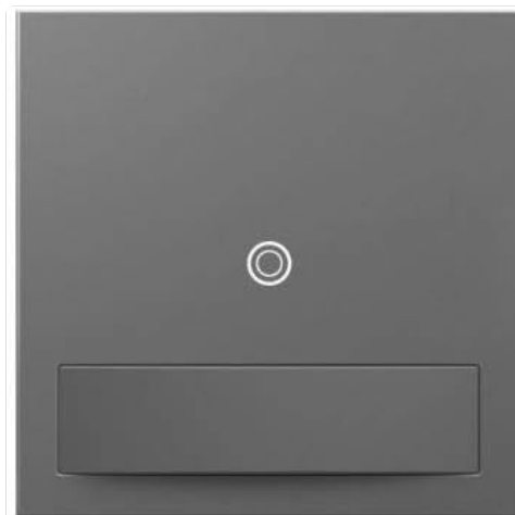
Image: The adore SensaSwitch in Magnesium finish, featuring a clean, modern design with a central motion sensor indicator and a lower manual override button.

This switch can be used for single-pole applications (controlling lights from one location) or integrated into multi-location setups for three-way or four-way control when paired with other adore switches or dimmers.