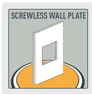
Image: A diagram showing the design of a screwless wall plate, indicating a clean and modern aesthetic once installed.

The innovative snap-in system ensures a secure and easy installation process. For safety, always ensure power is turned off at the circuit breaker before beginning any electrical work.